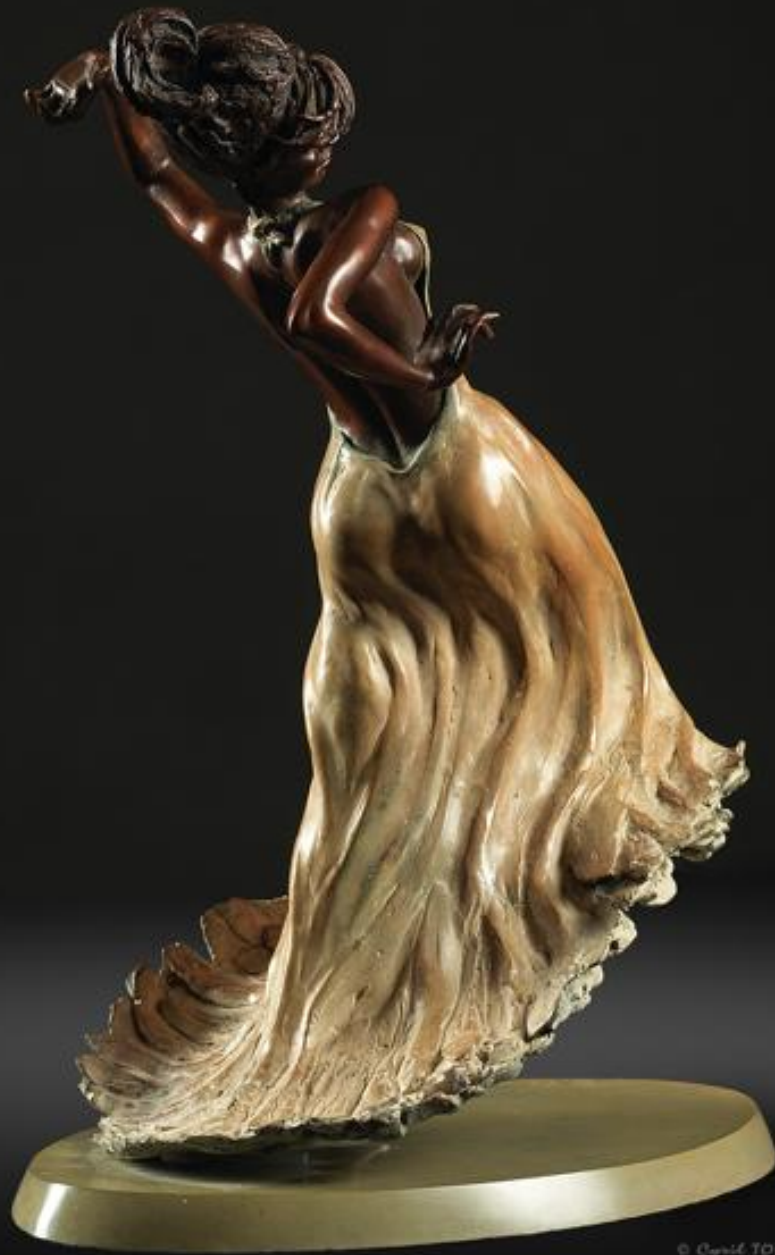
LITTLE DANCER Bronze with two tone patina Edition of 12 Height 36cm, Weight 5kg