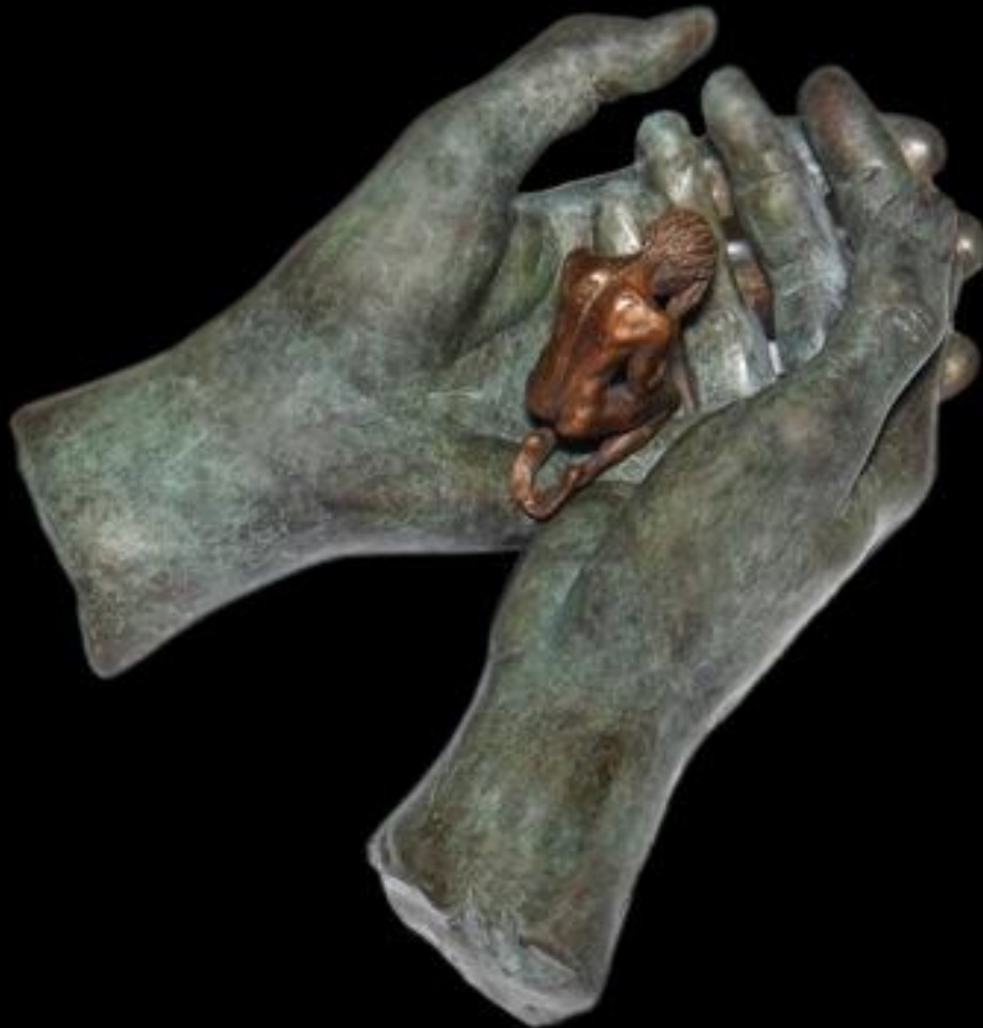
HANDS OF GOD Bronze with two tone patina Edition of 99 Height 19cm, Length 23cm, Width 22cm, Weight 5kg