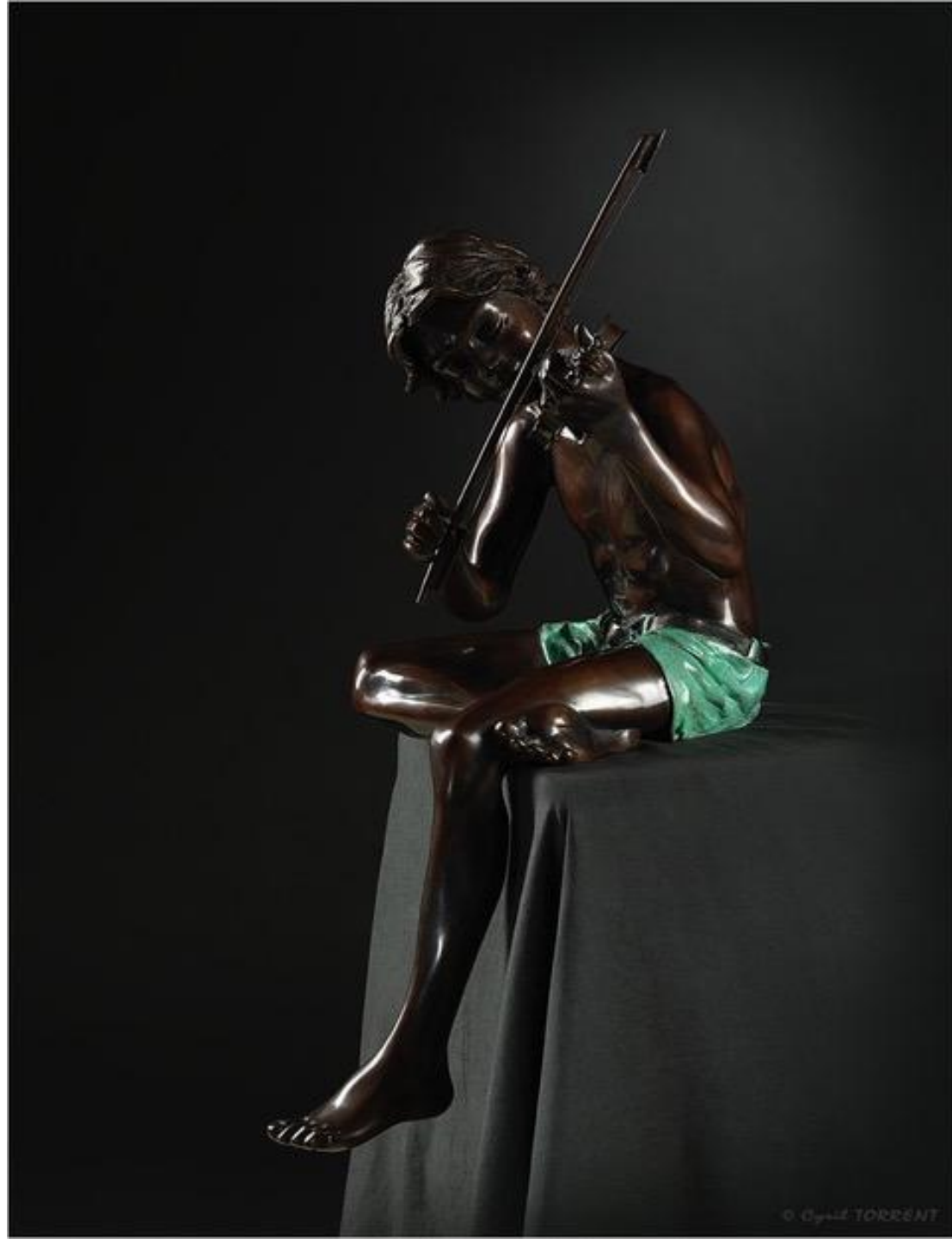
VIOLINIST Bronze with two tone patina Edition of 12 Height 50cm, Width 40cm, Weight 12kg