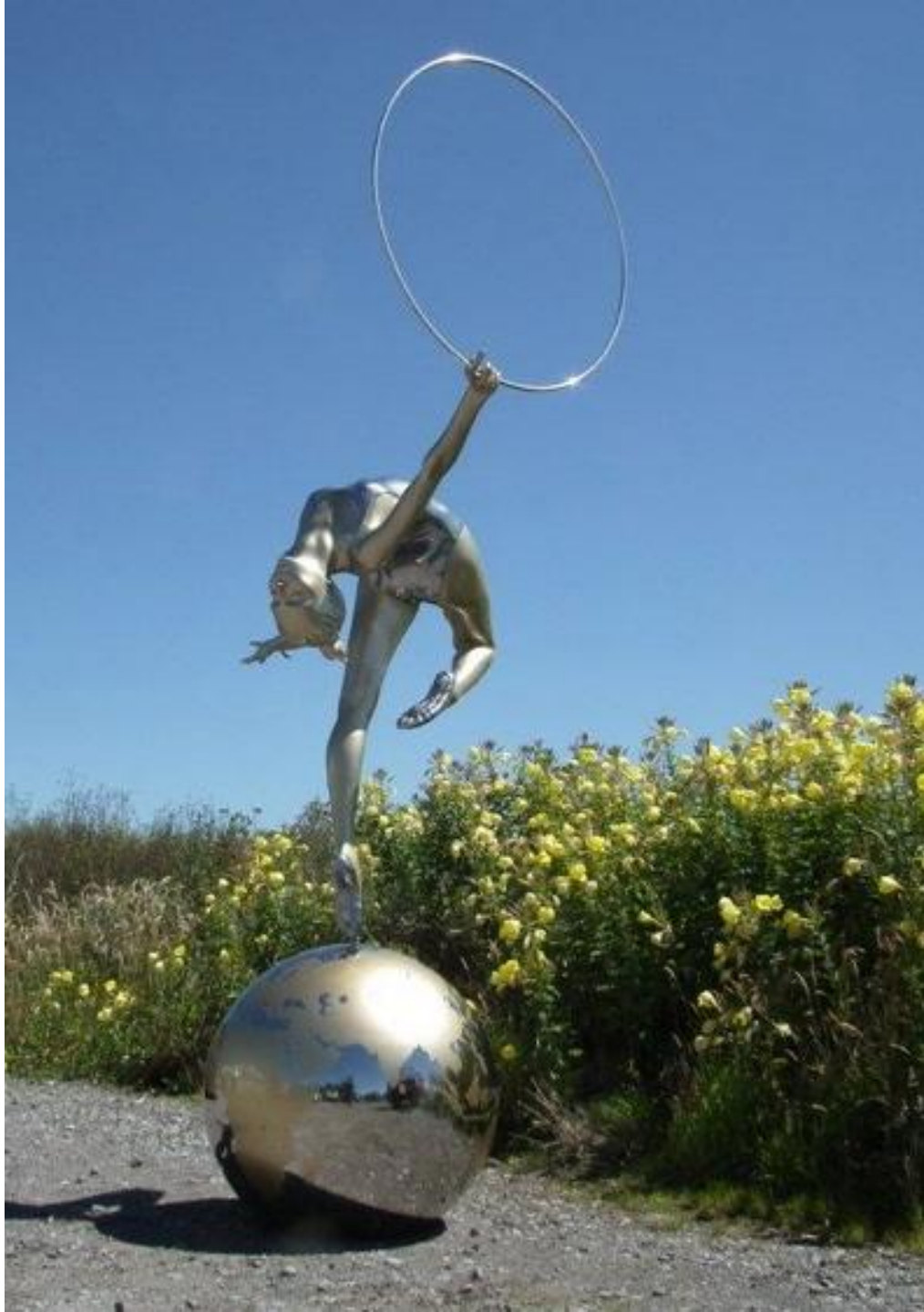
POISE 3m for outside Cold Cast Bronze with bronze and silver finish, mounted on stainless steel world with stainless steel hoop Edition of 6 Height 300cm, Width 150, Depth 130, Weight 120kg