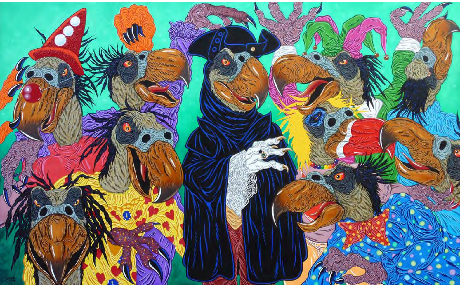
Terror Birds Carnival Oil on canvas 100 x 160 cm 2012