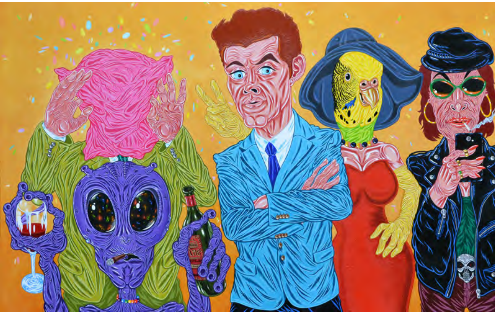
Curious Muses Oil on canvas 100 x 160 cm 2013