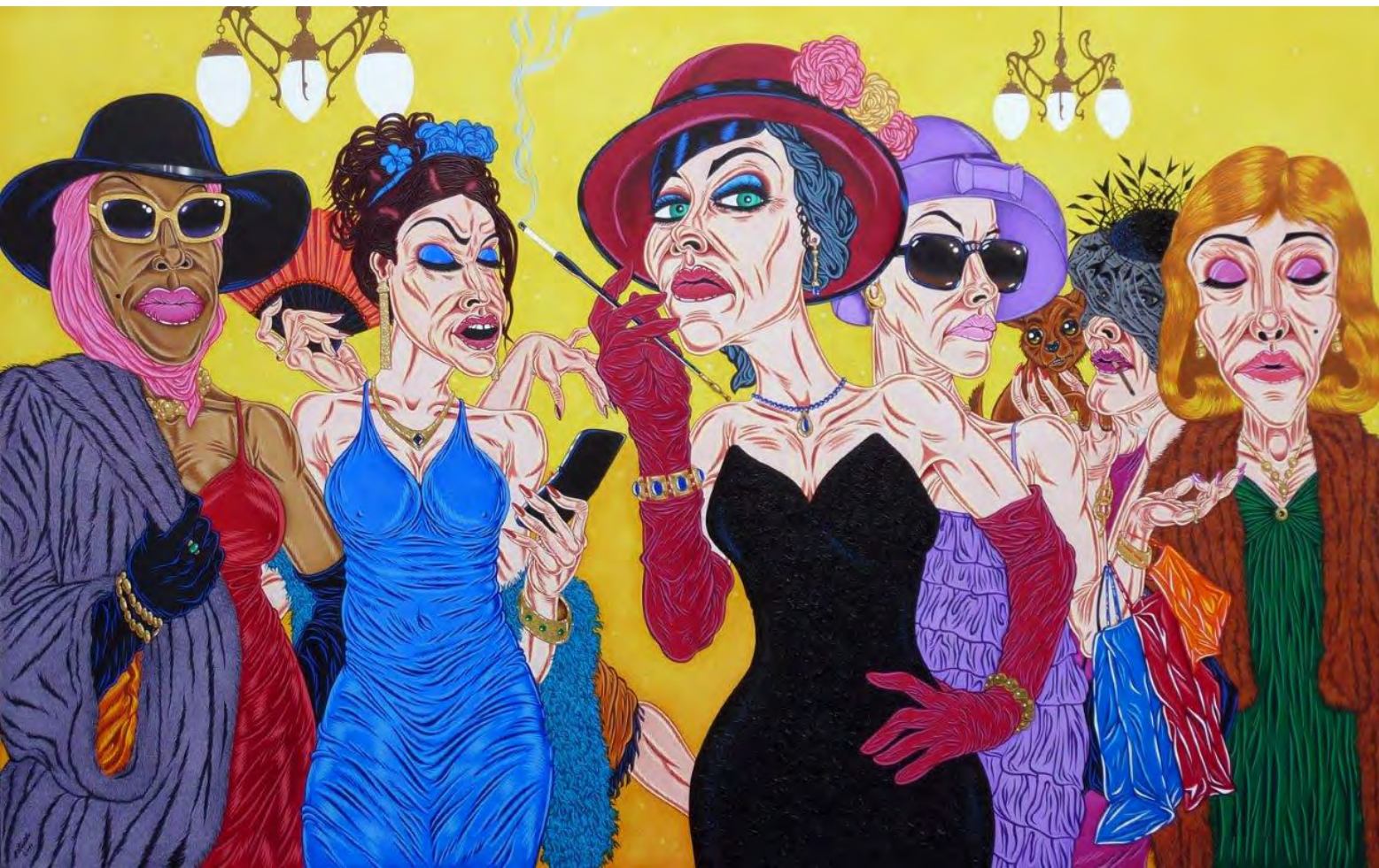
Divas Oil and gold on canvas 100 x 160 cm 2011