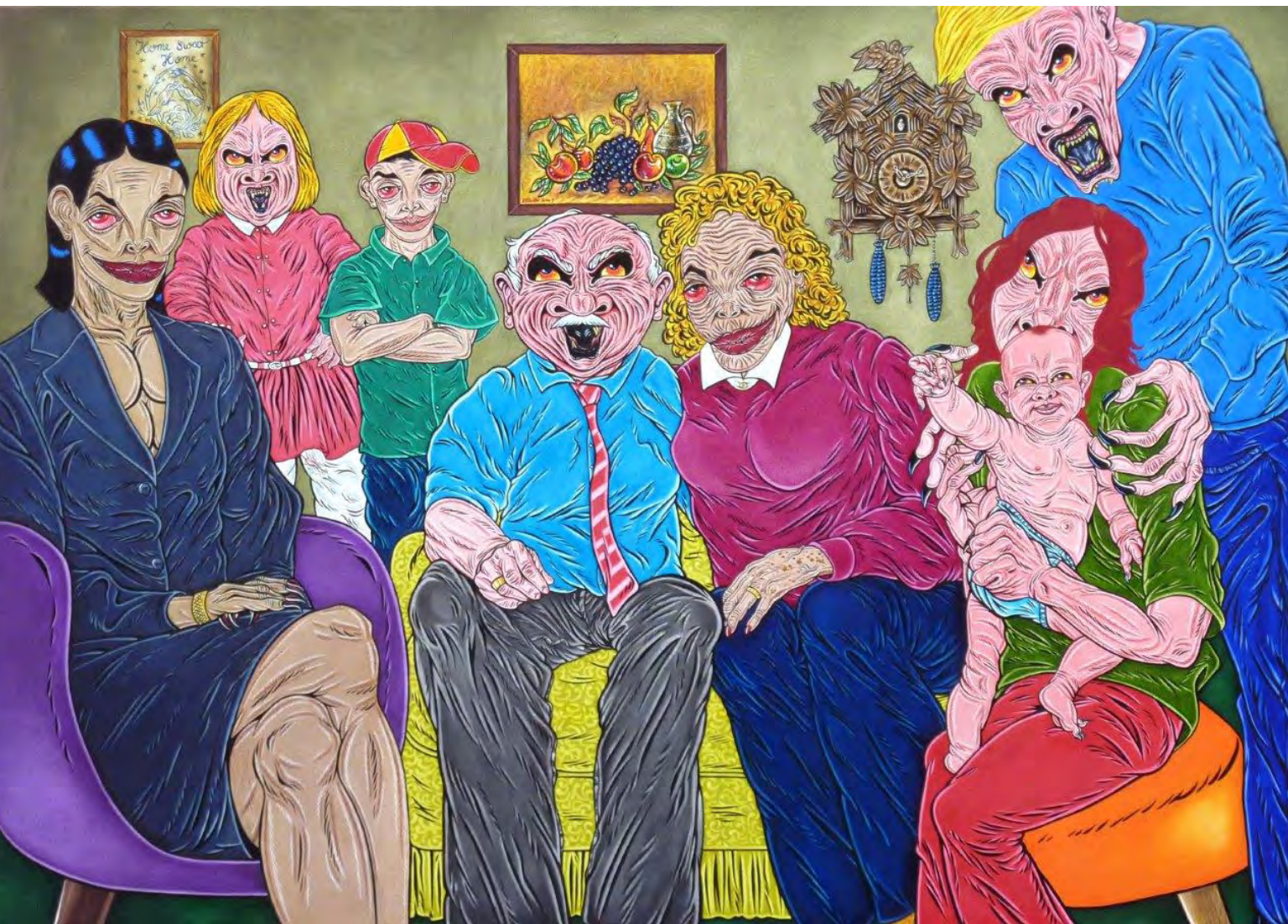
Family Ties Oil on canvas 100 x 140 cm, 2009