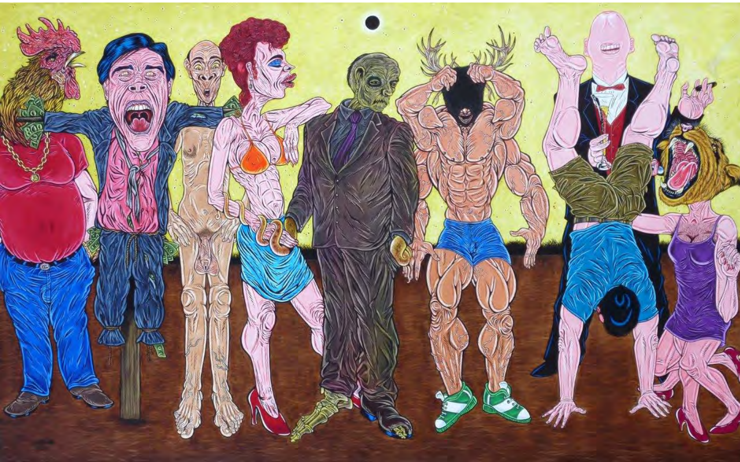
These Wiggly Vanities Before Death Oil on canvas 100 x 160 cm, 2010