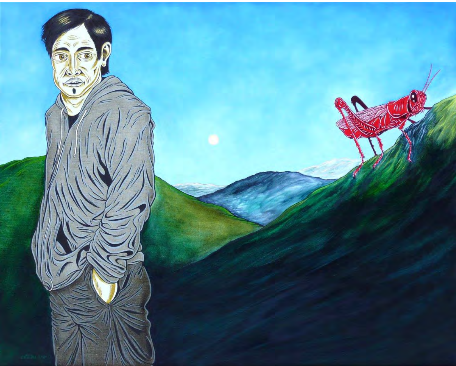
Hills Oil on canvas 80 x 100 cm 2010