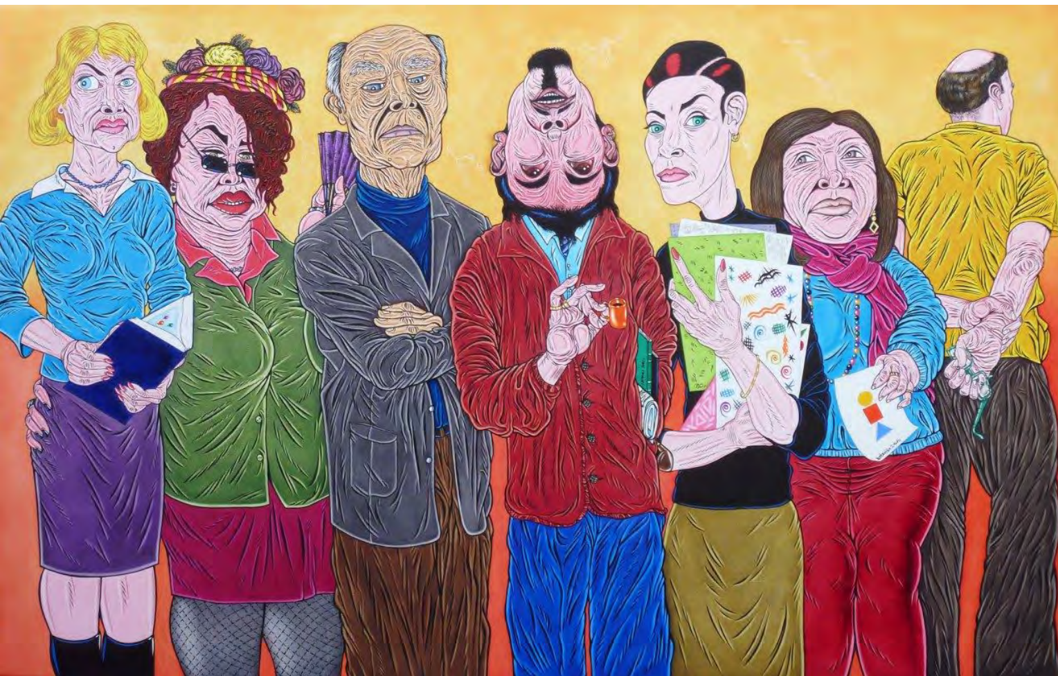
Cultural Popes Oil on canvas 100 x 160 cm 2010