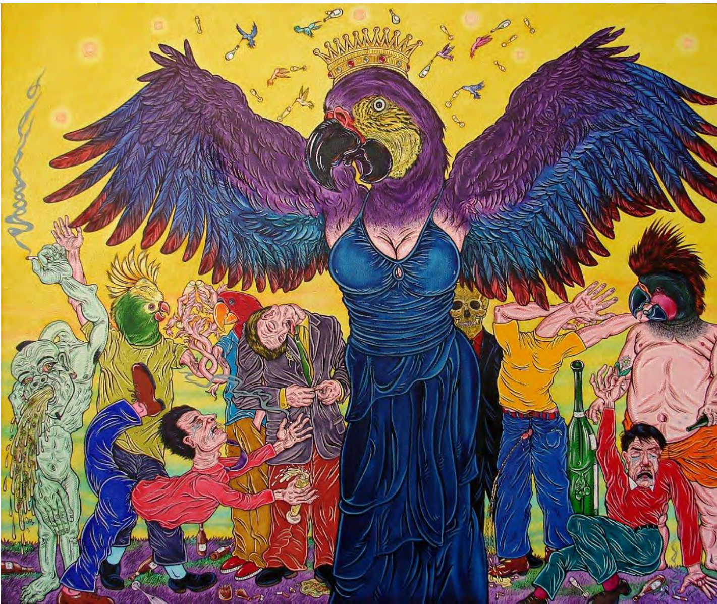
The Triumph Of The Guzzler's Goddess Oil on canvas 100 x 120 cm 2007