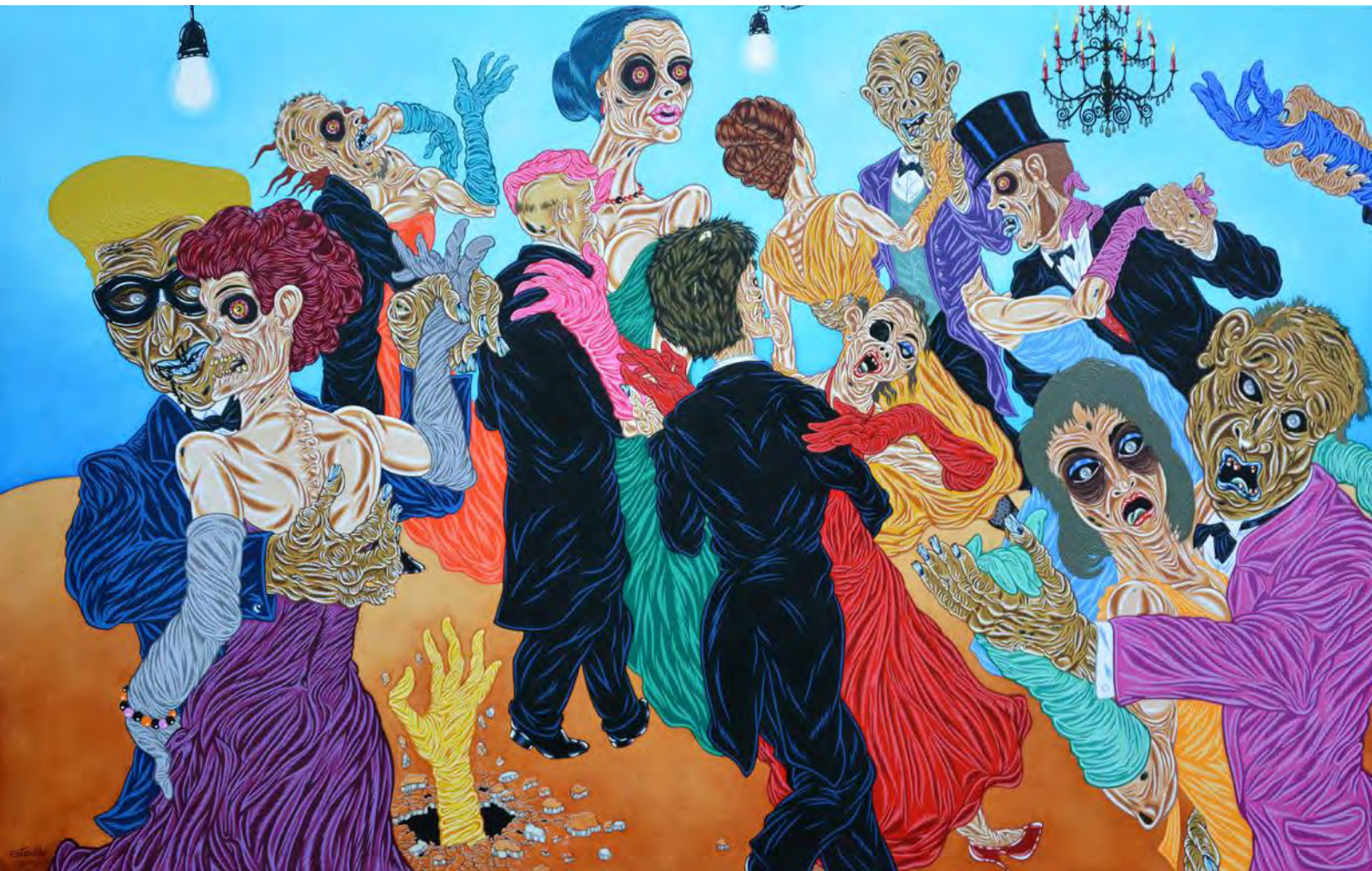
Opera Ball Oil on canvas 100 x 160 cm 2013