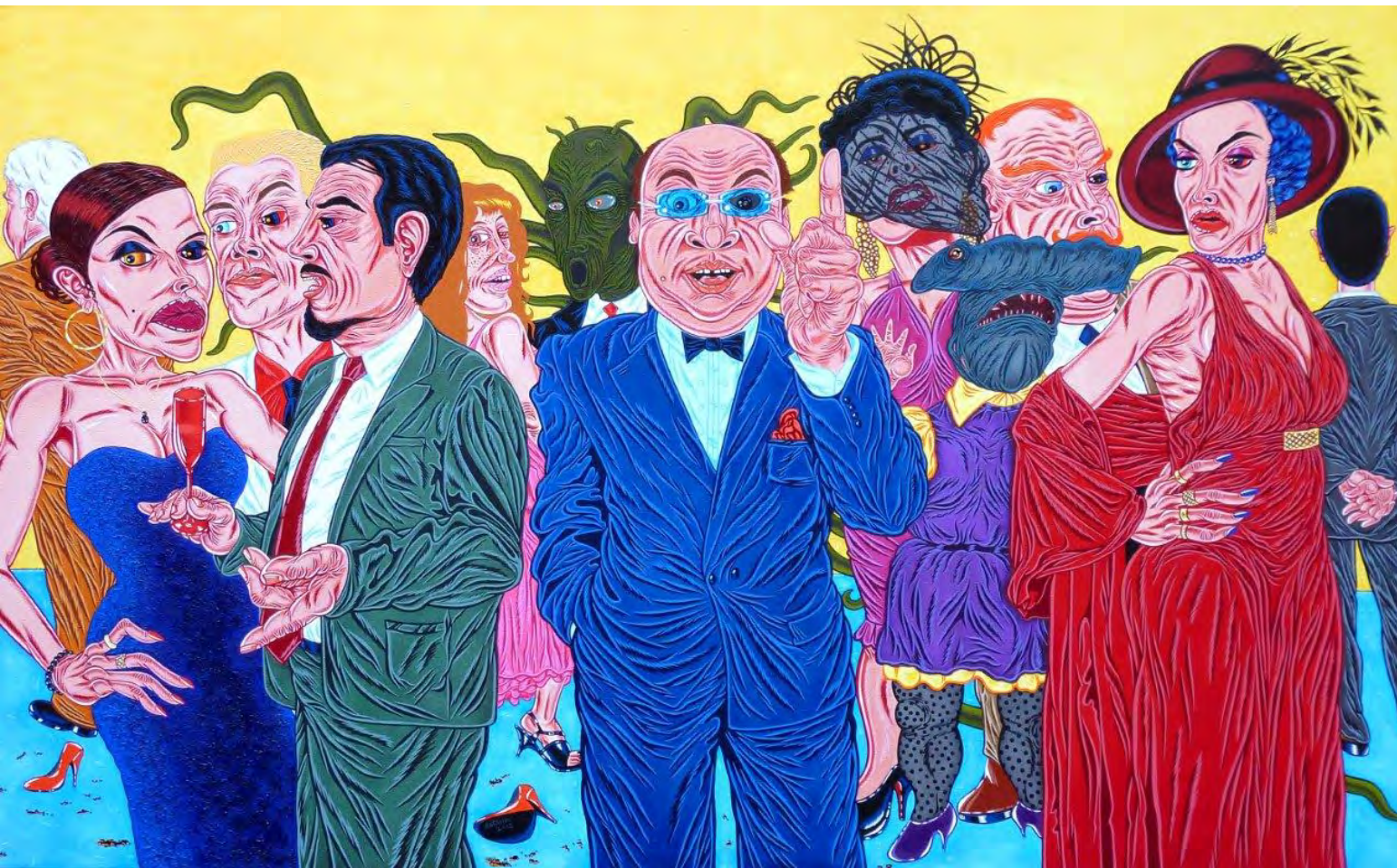
Androids Oil on canvas 100 x 160 cm 2012