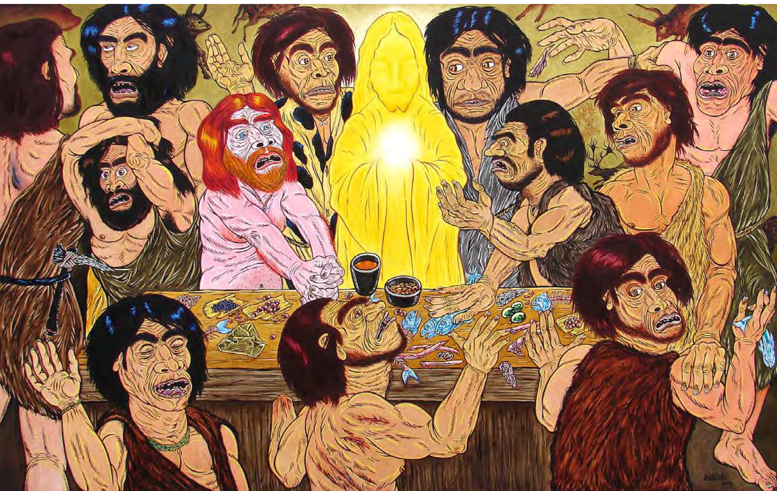
The First Supper Oil on canvas 100 x 160 cm 2009