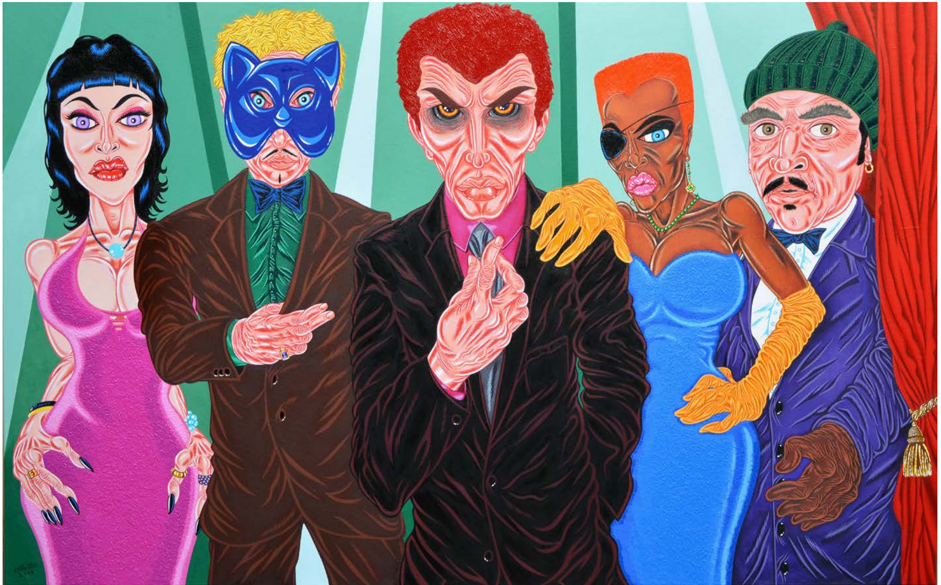
Predator Oil on canvas 100 x 160 cm, 2014