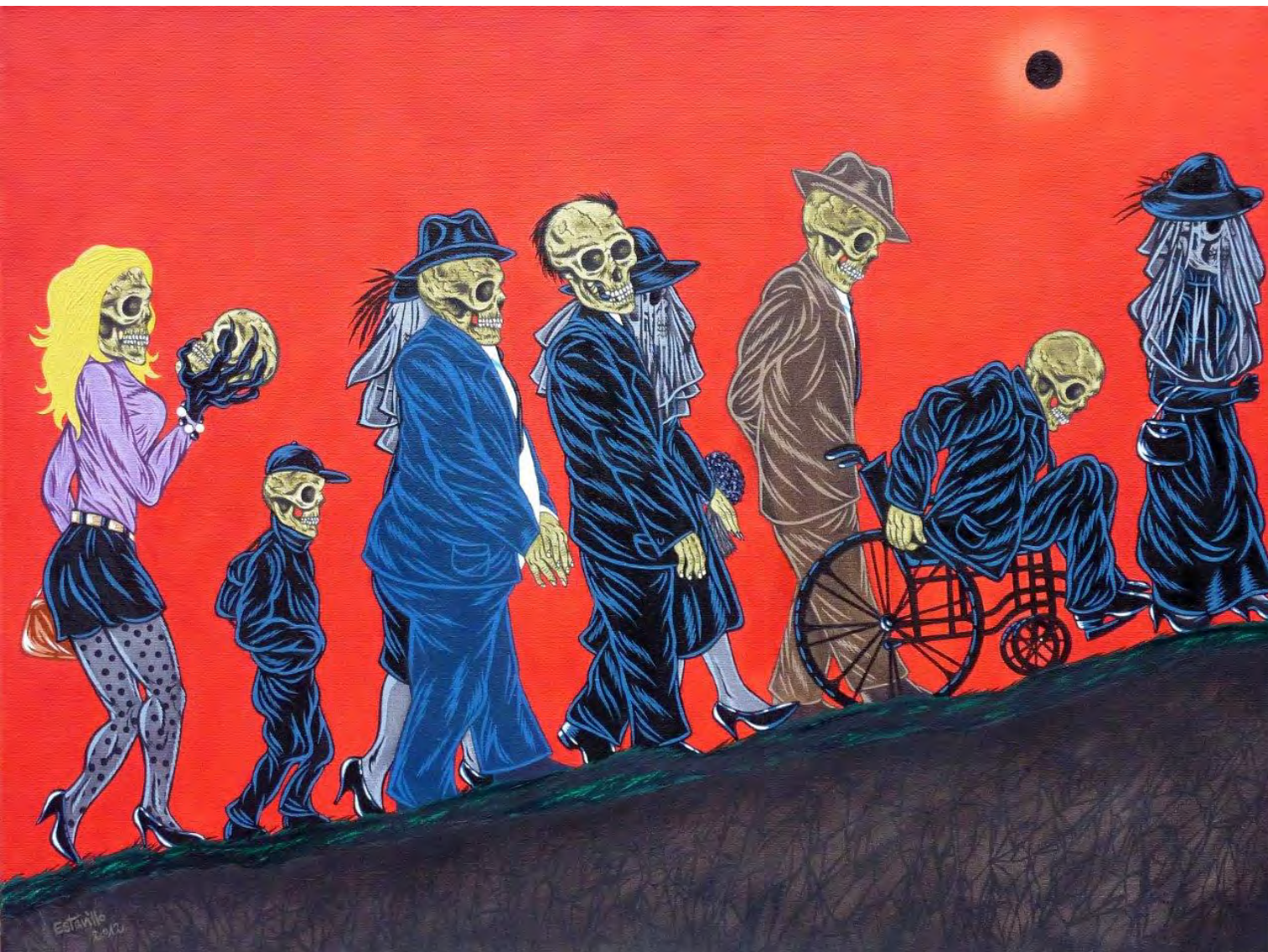
Funeral March Oil on canvas 60 x 80 cm 2012