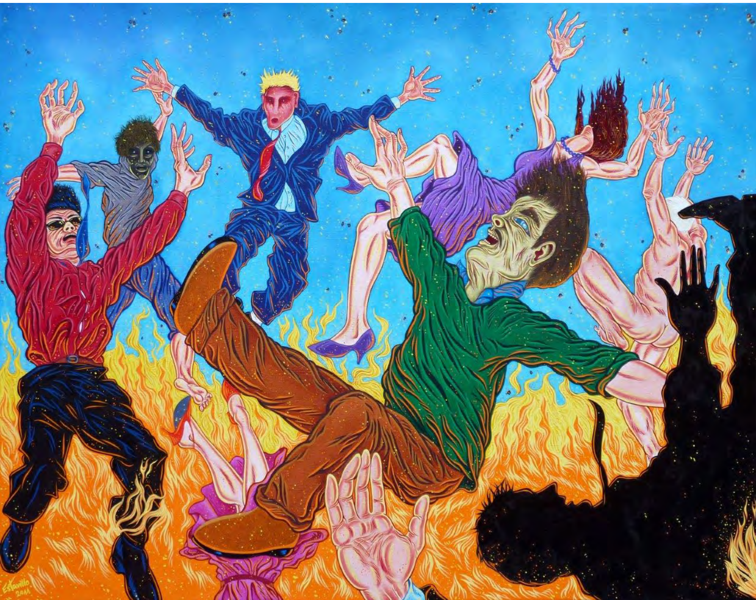
And They Will Fall Like Snow Oil on canvas 80 x 100 cm 2011