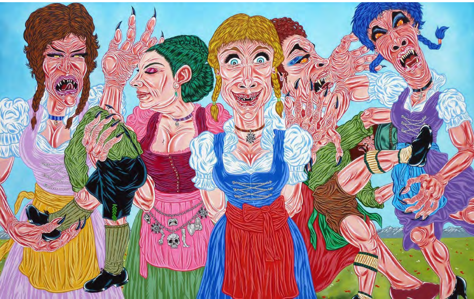
Bavarian Maenads Oil on canvas 100 x 160 cm 2013