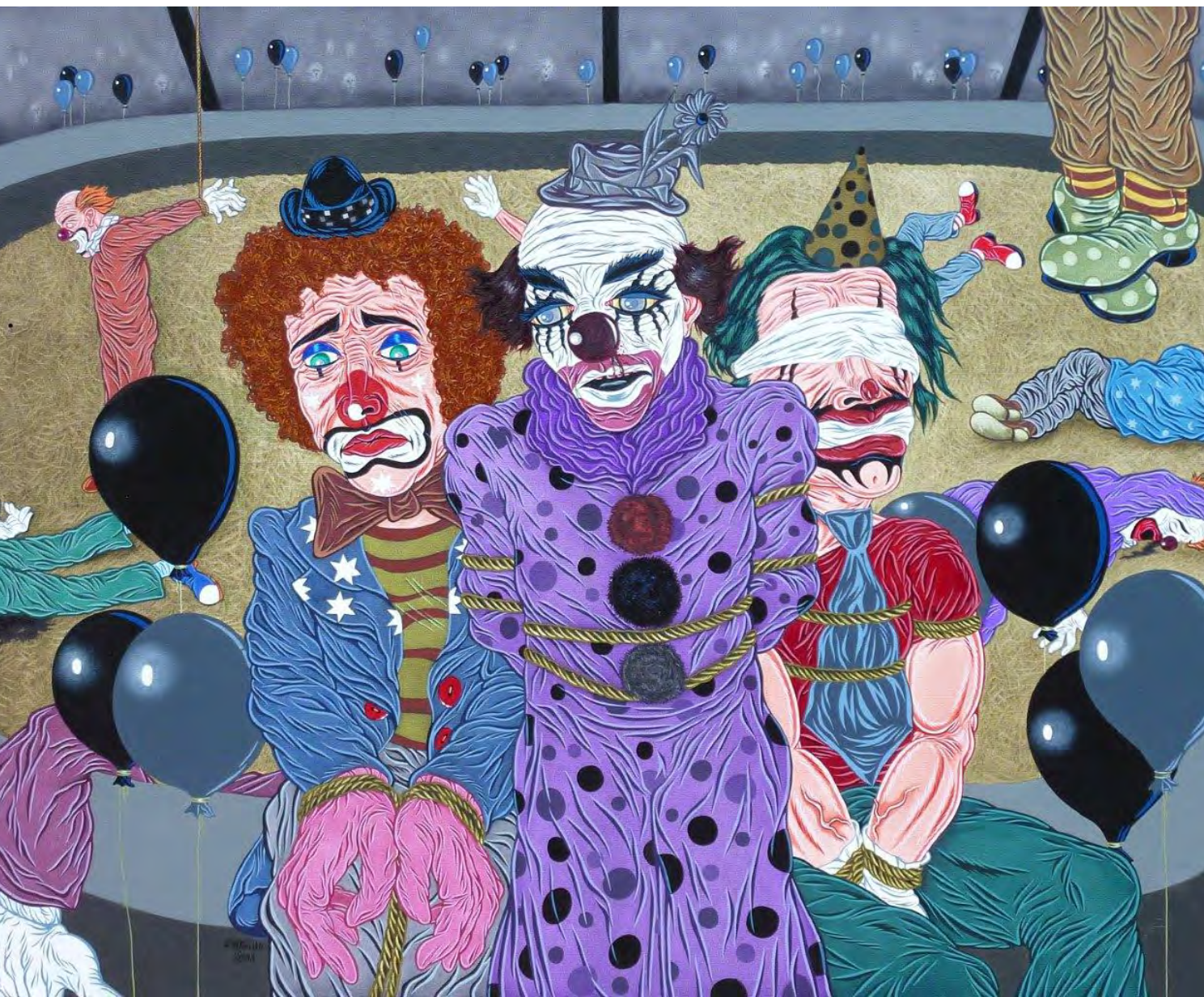
Bad Times For Clowns Oil on canvas 100 x 120 cm 2011