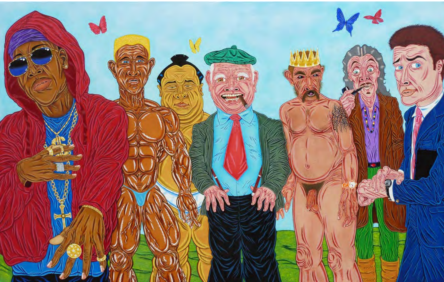
Alpha Animals Oil on canvas 100 x 160 cm, 2011