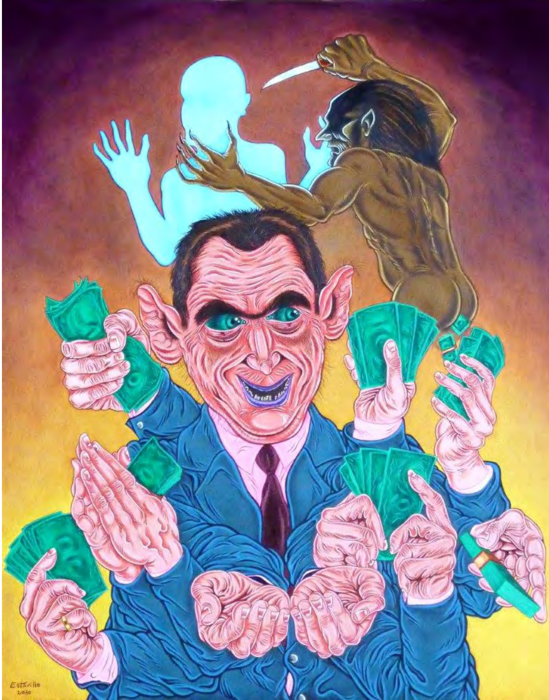
Avarice Kills Honour Oil on canvas 100 x 80 cm, 2010