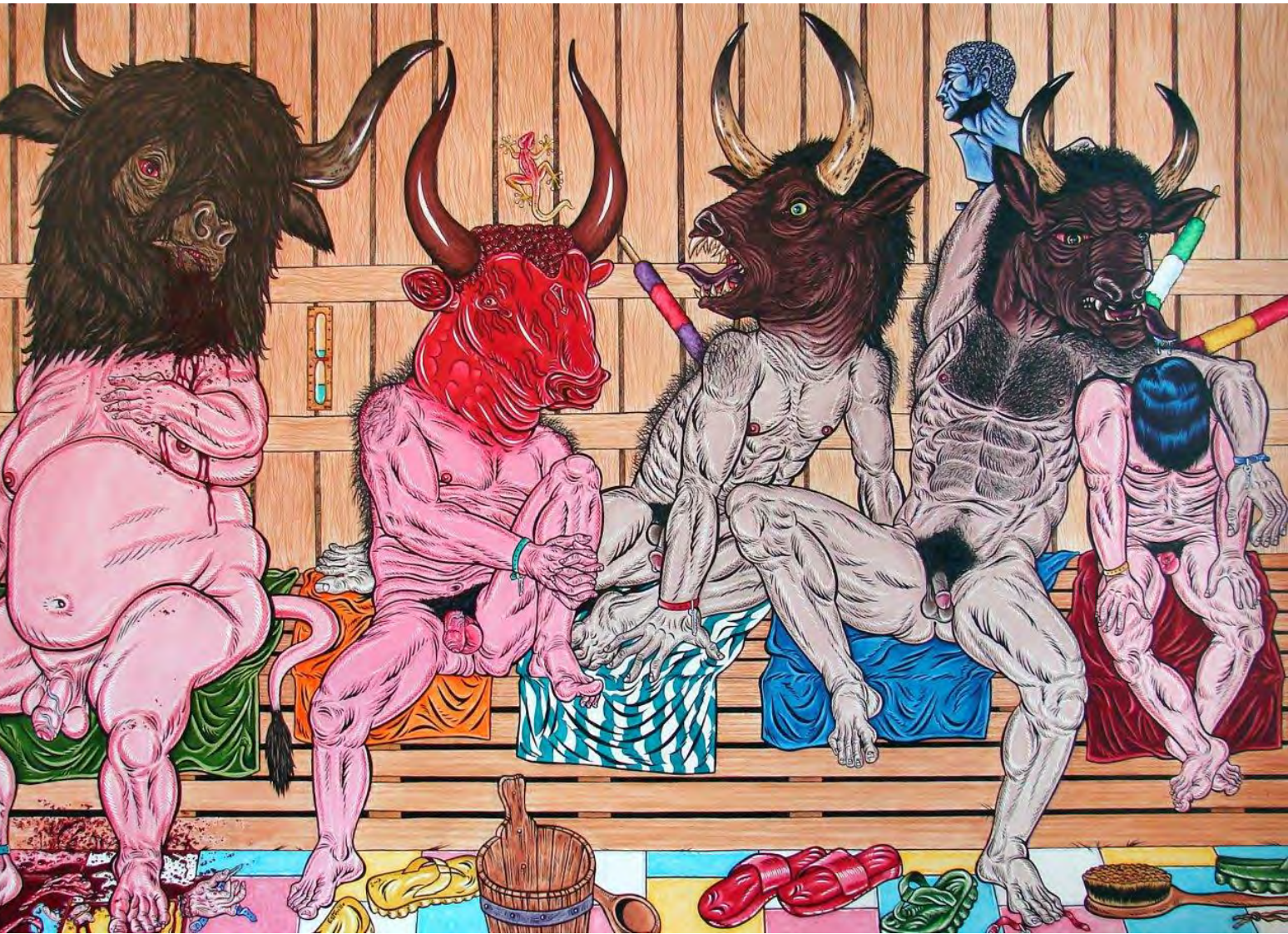
Minotaurs' Sauna Oil on canvas, 100 x 140 cm 2007