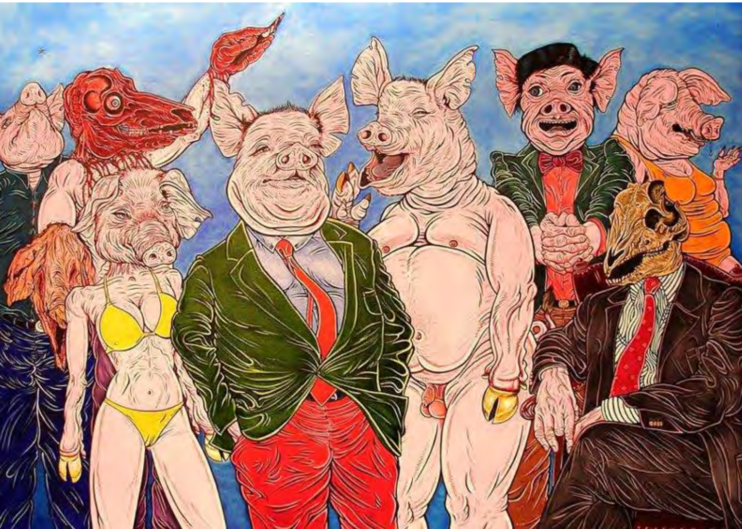
Domestic Pigs Oil on canvas 100 x 140 cm 2007