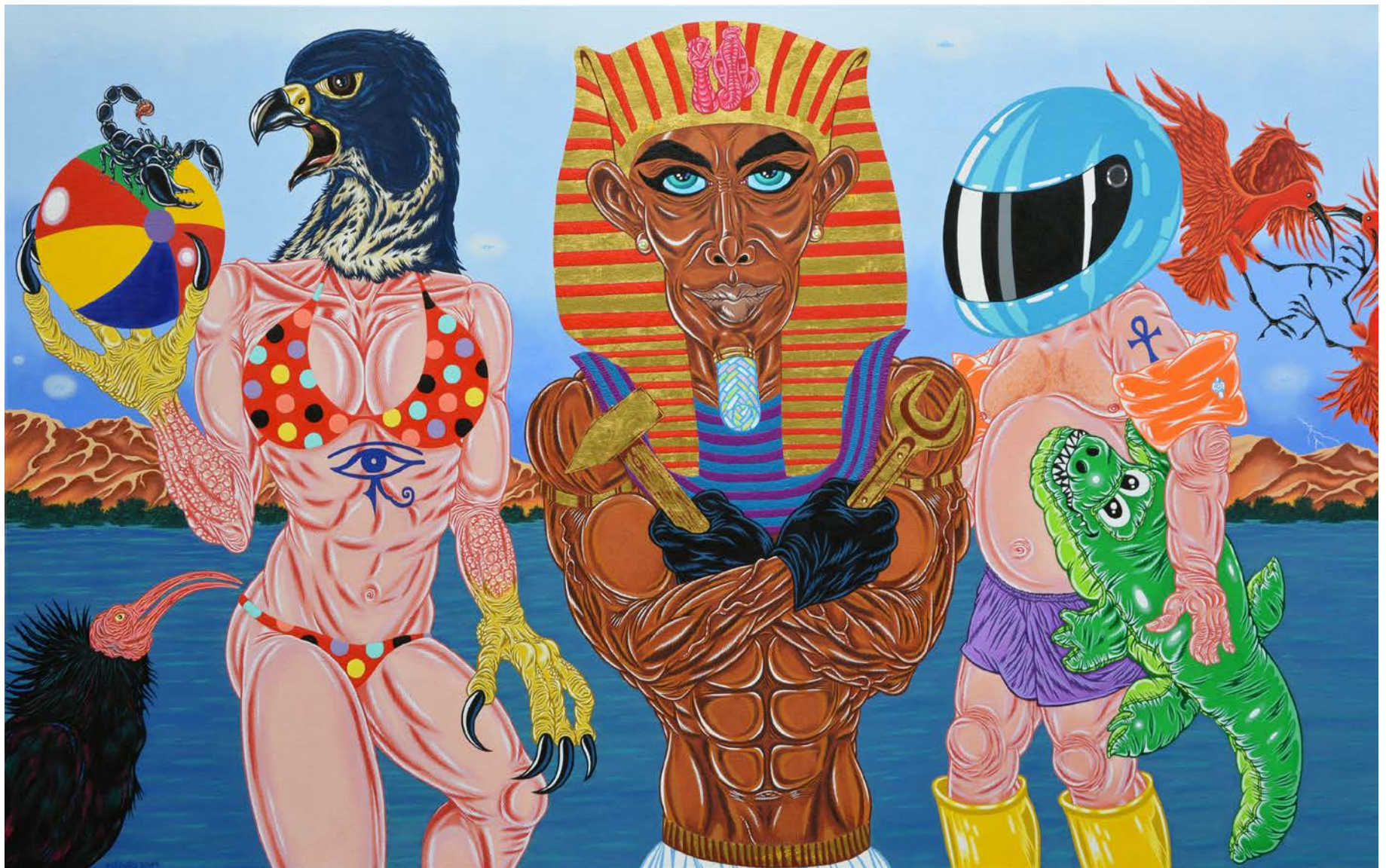
Crazy Pharaohs Oil and gold leaf on canvas 100 x 160 cm, 2014