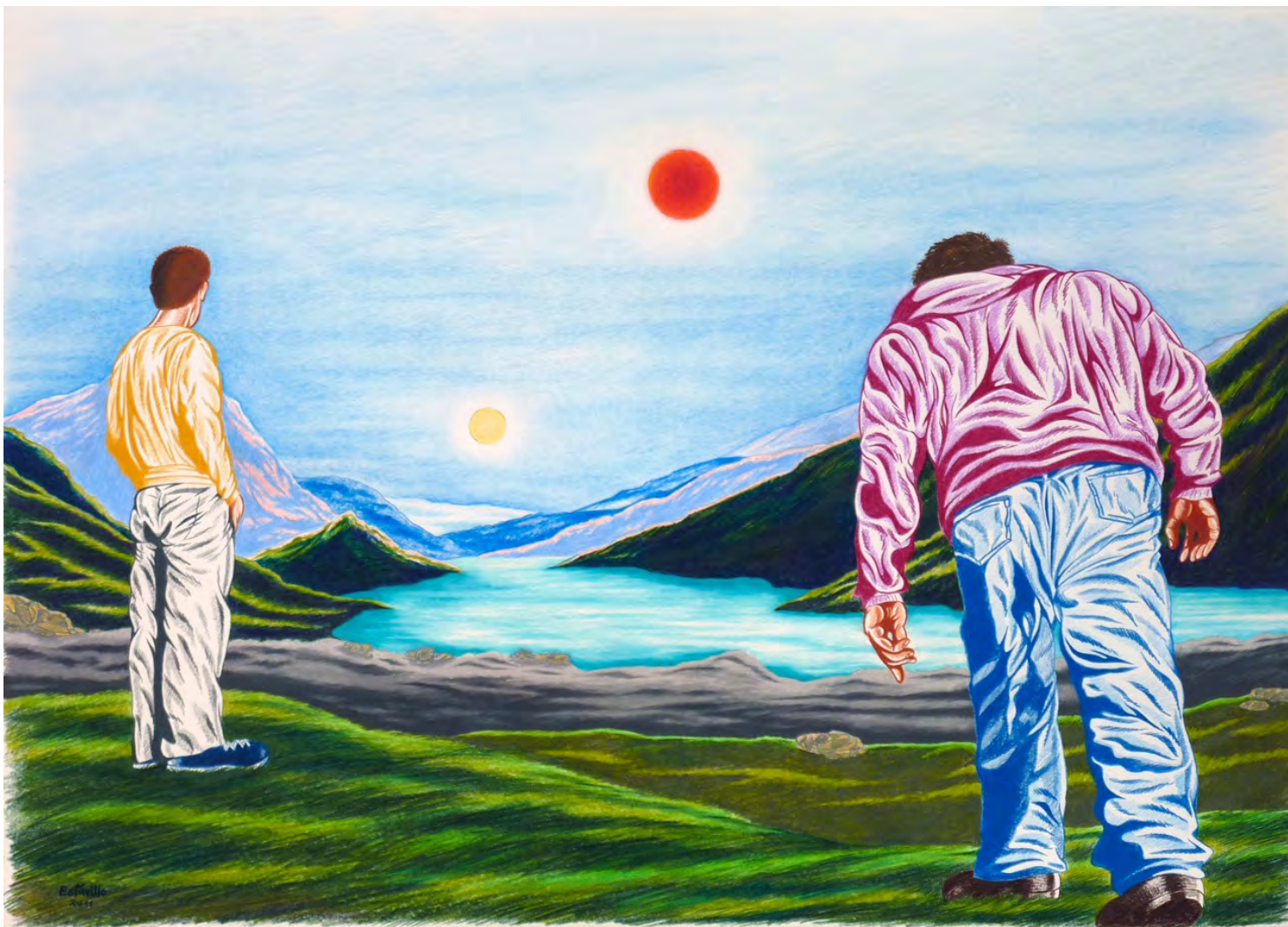
Arrival Colour pencil on drawing cardboard 50 x 70 cm, 2011