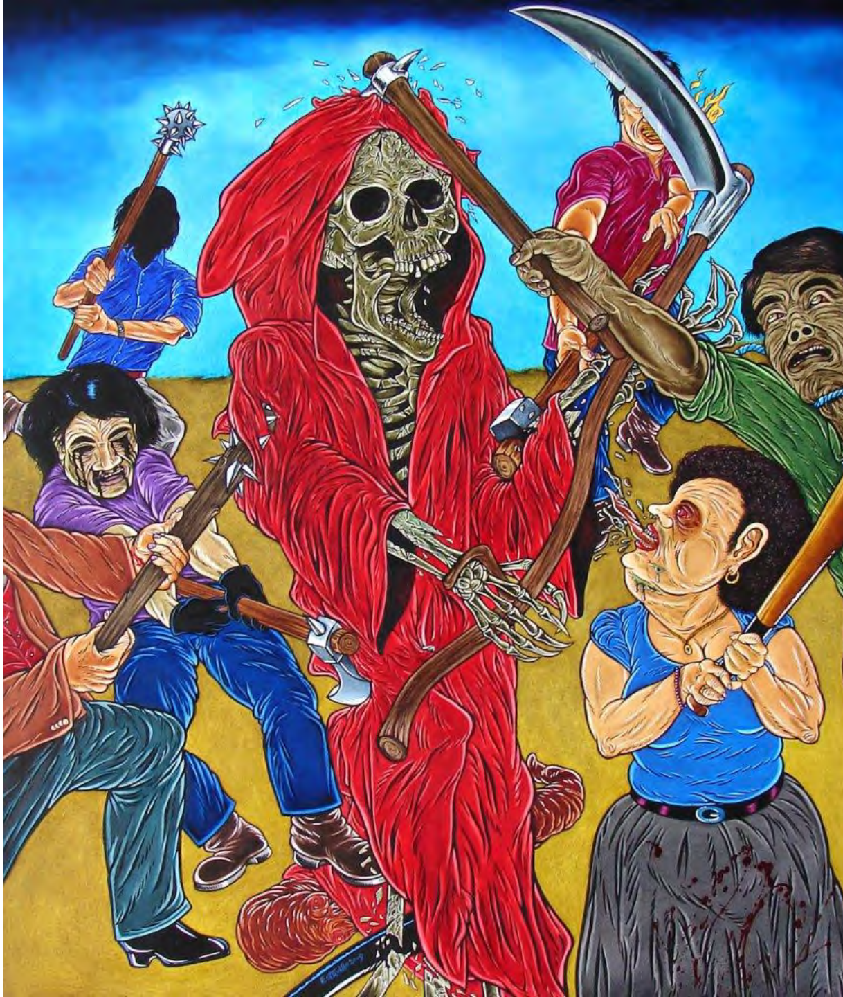
Smashing The Grim Reaper Oil on canvas 120 x 100 cm, 2009