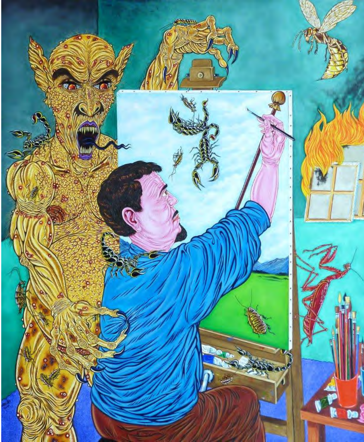
Envy Of The Hell Firstborn Oil on canvas 120 x 100 cm, 2010