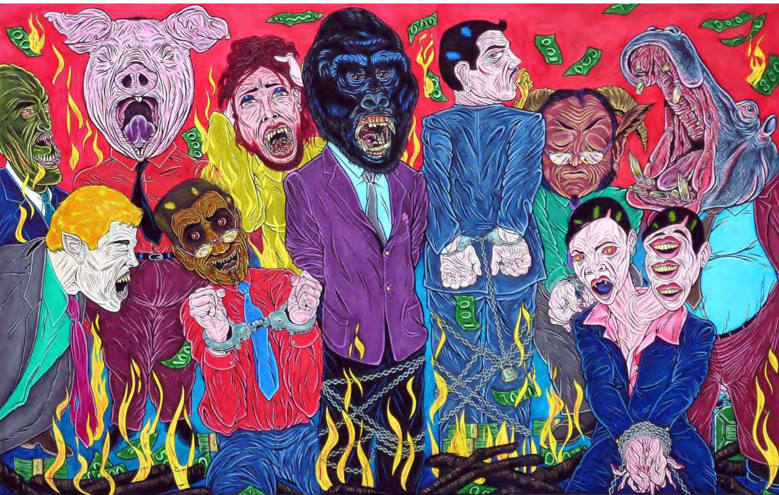
Combustion Of Bankers Oil on canvas 100 x 160 cm 2009