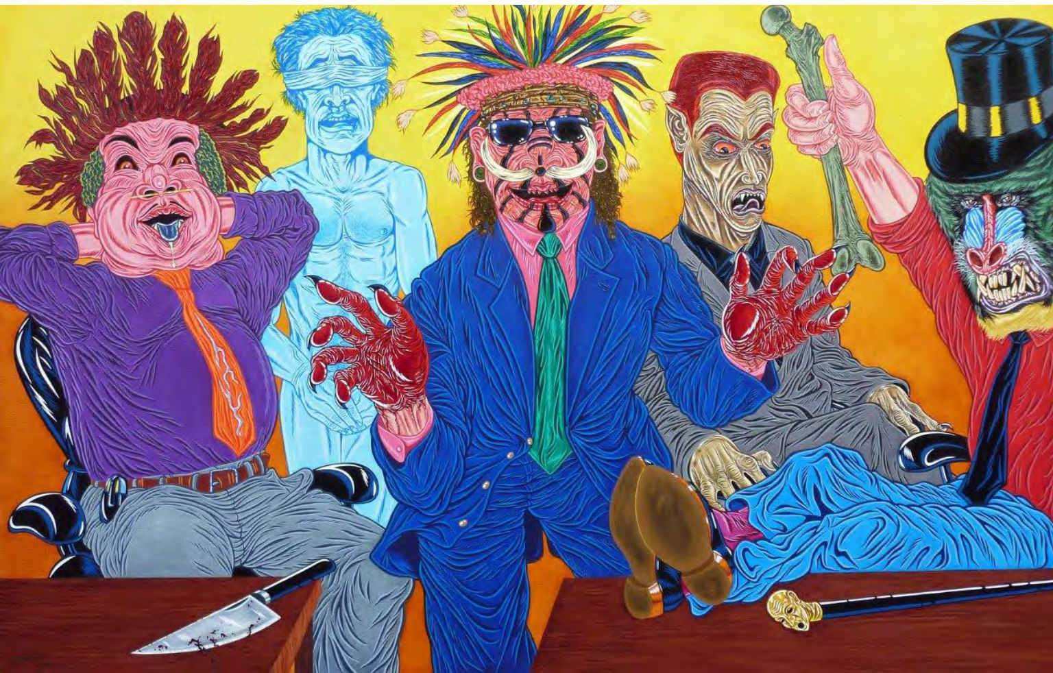
Cannibal Meeting Oil on canvas 100 x 160 cm 2011