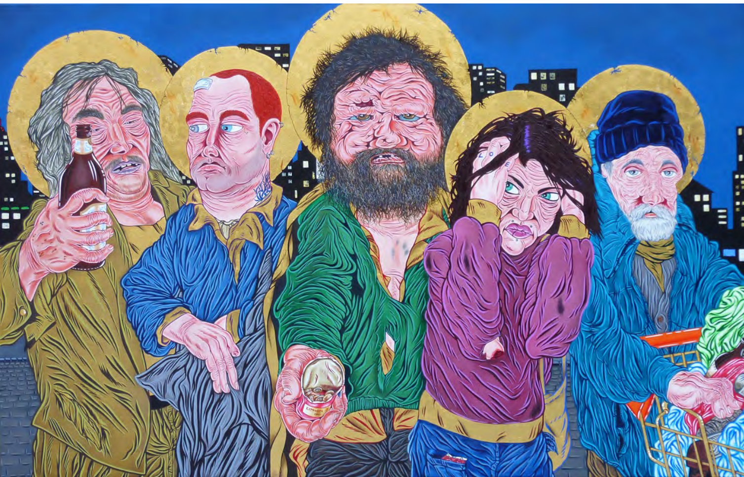
The Forgotten Saints Oil and gold on canvas 100 x 160 cm 2010