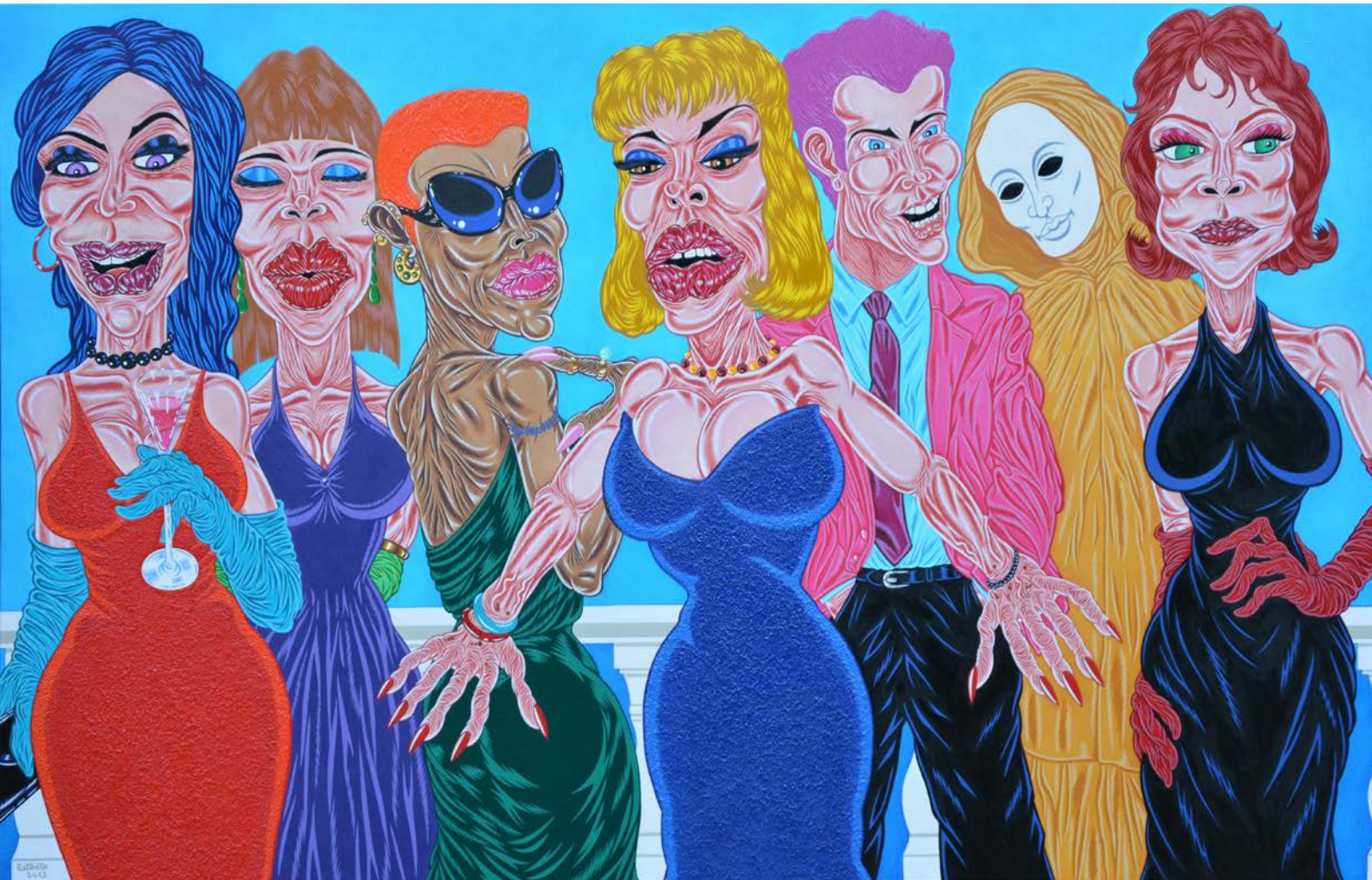
Botox Elves Oil on canvas 100 x 160 cm 2013