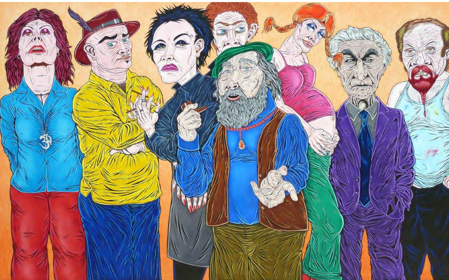
Beloved Colleagues Oil on canvas 100 x 160 cm, 2010