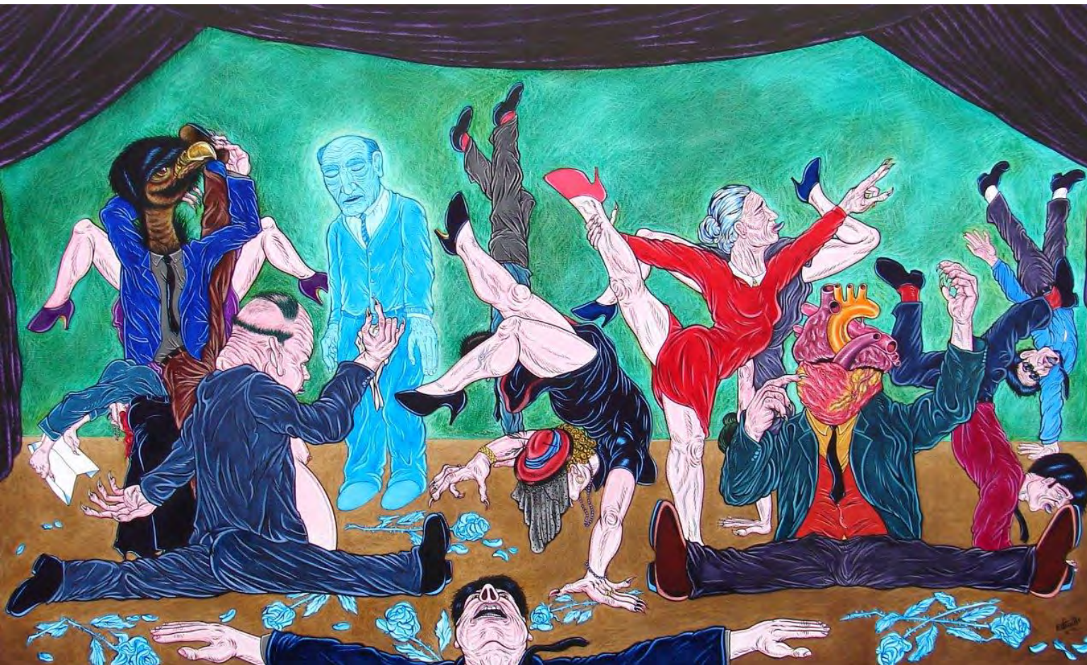
Opening Of Will Oil on canvas 100 x 160 cm 2008