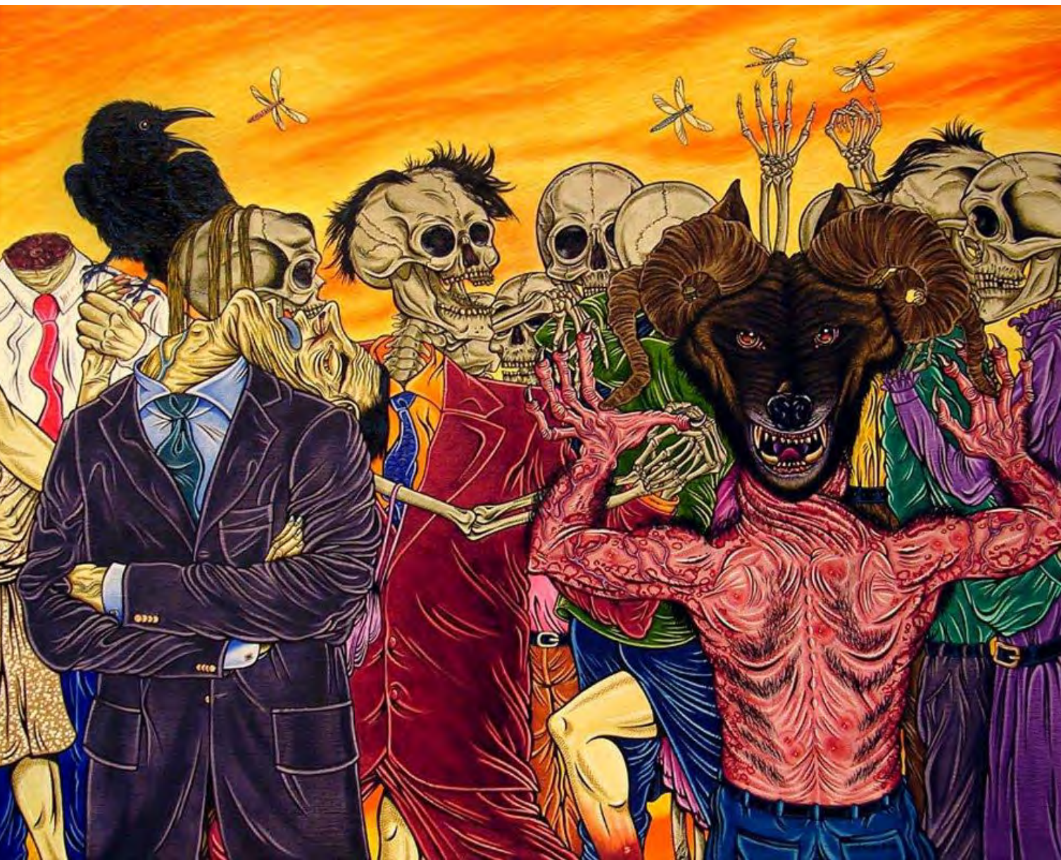
Macabre Dance School Oil on canvas 70 x 100 cm 2006