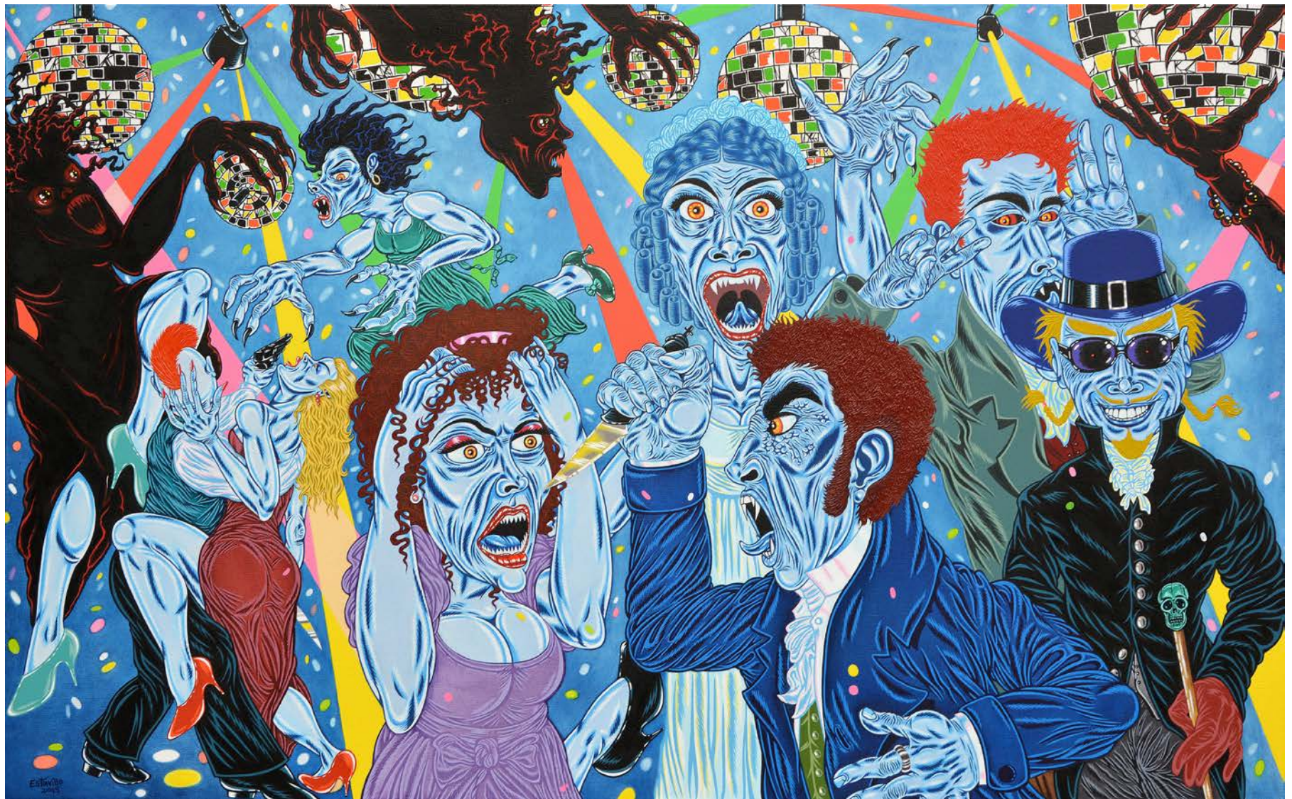
Furies Disco Oil on canvas 100 x 160 cm, 2015