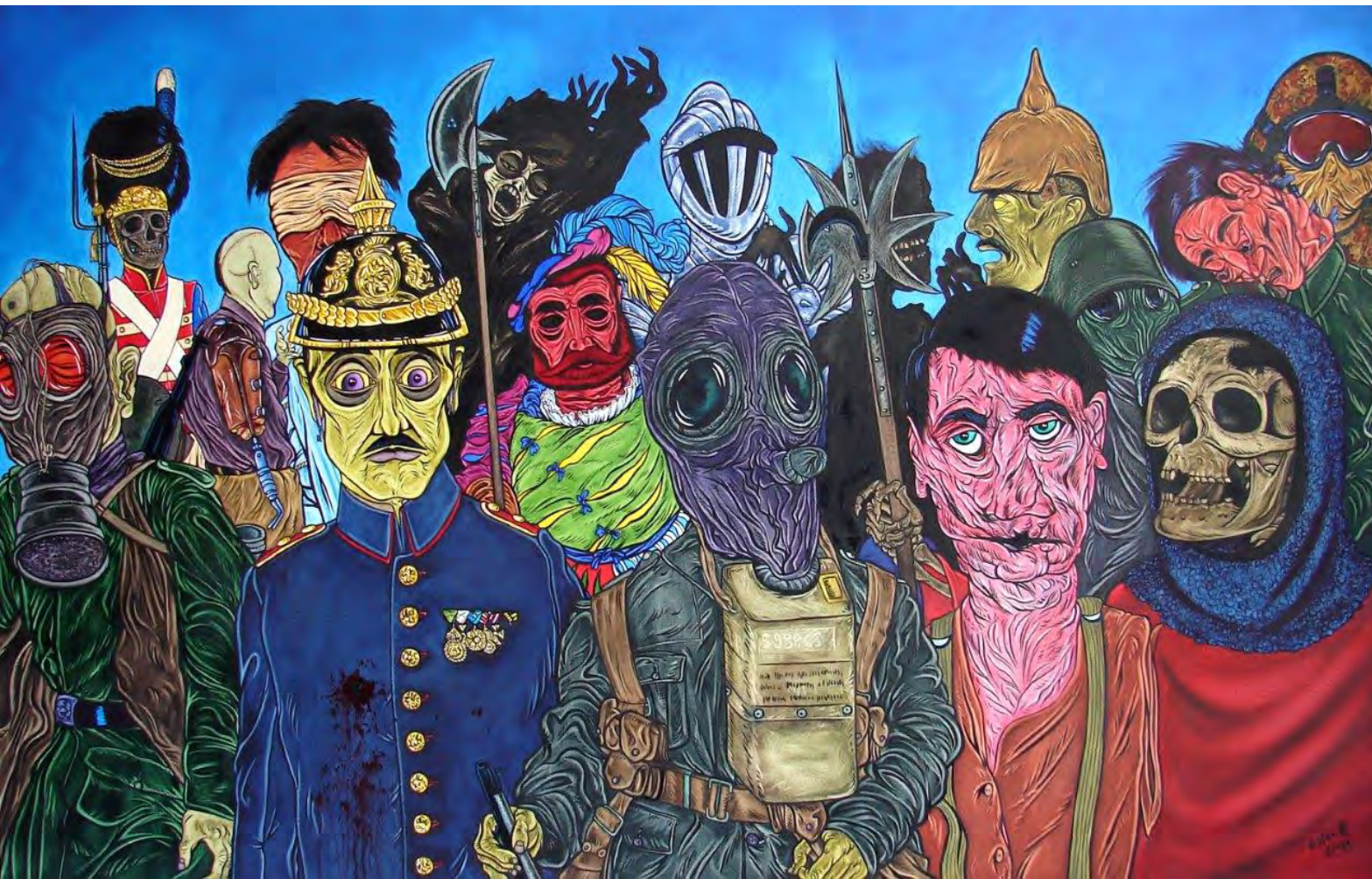
Veteran Reunion Oil on canvas 100 x 160 cm 2008