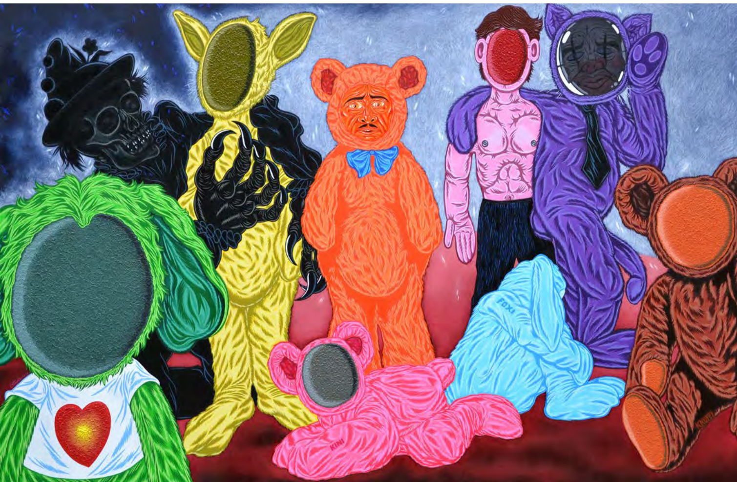
Melancholic Soft Toys – Epitaph For Our Rabbits Oil on canvas 100 x 160 cm 2013