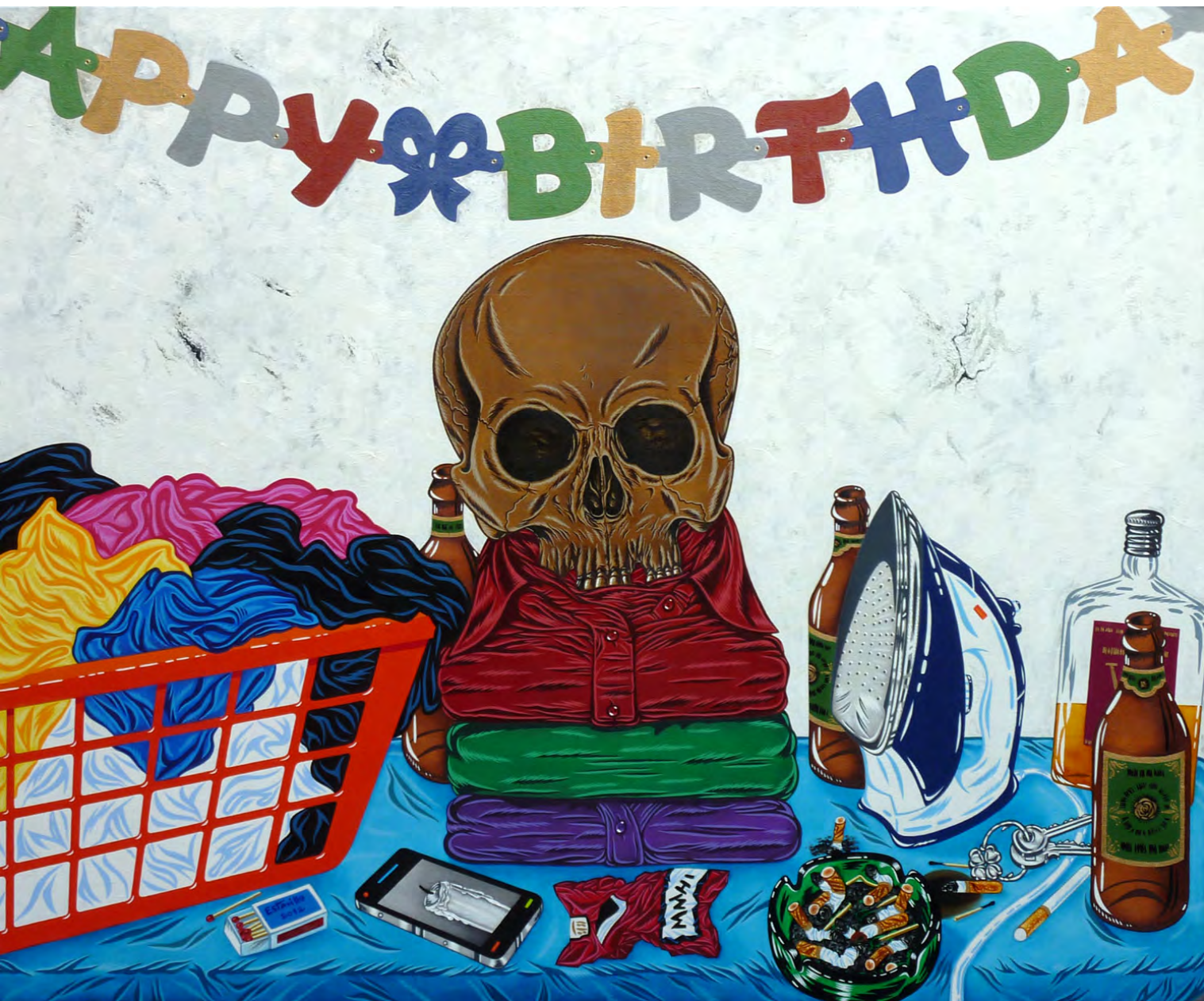
Vanitas Oil on canvas 100 x 120 cm 2012