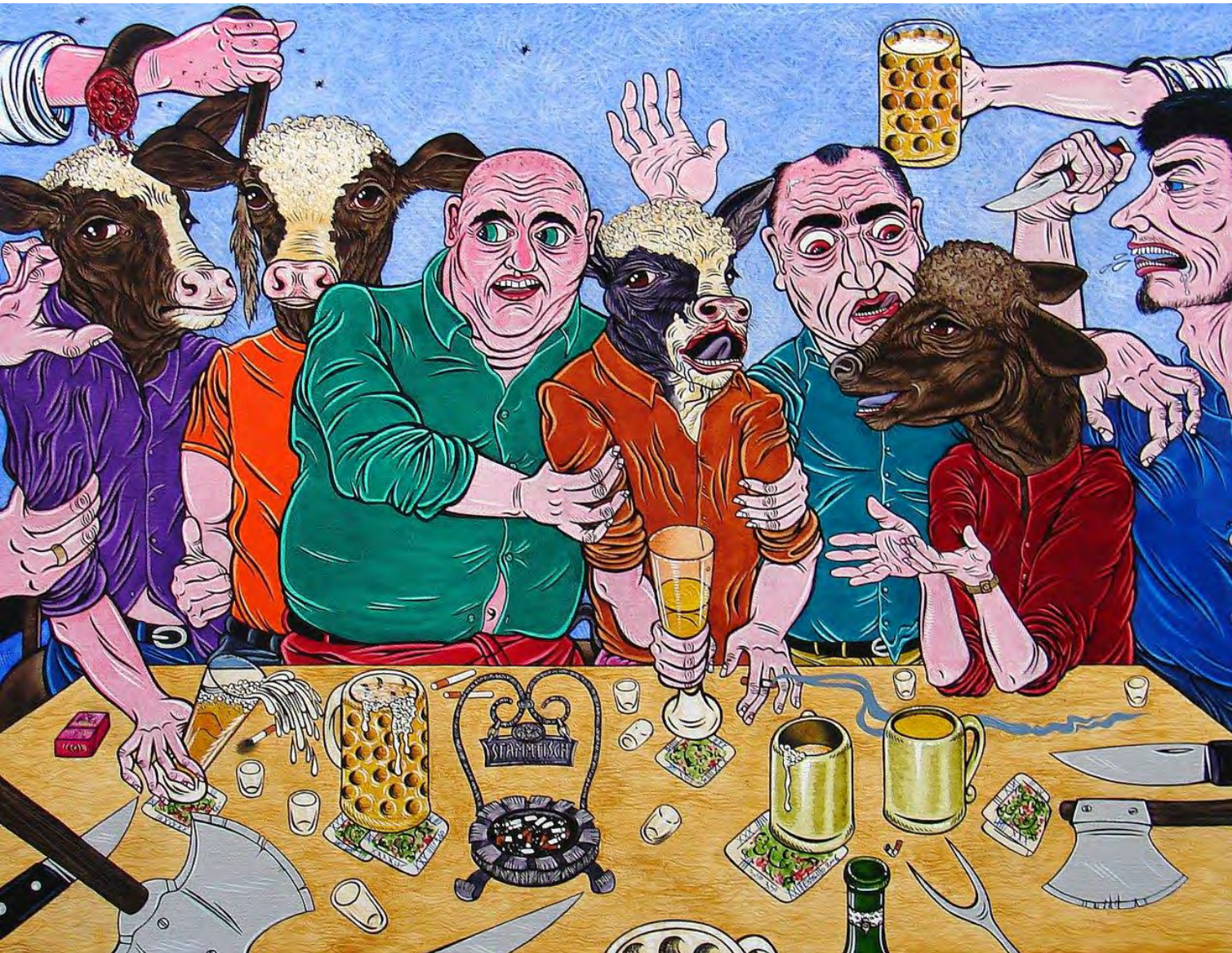
Only The Very Stupid Calves ... Oil on canvas 80 x 100 cm, 2006