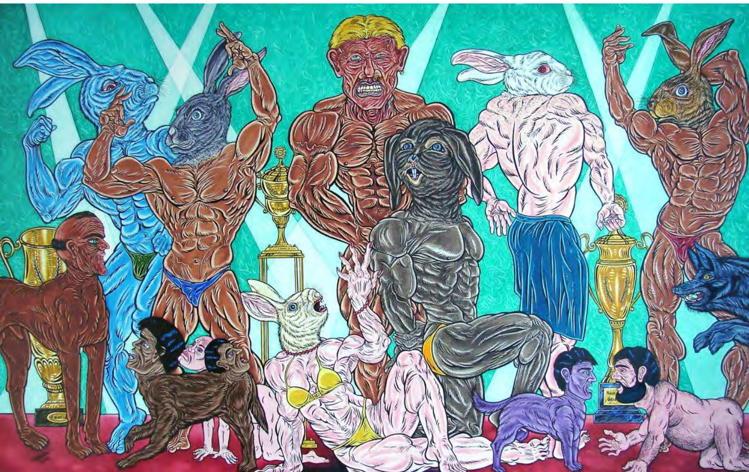
Philosophers' Training Oil on canvas 100 x 160 cm 2008