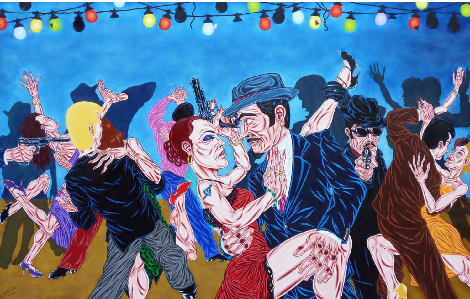
Killers' Tango Oil on canvas 100 x 160 cm, 2012