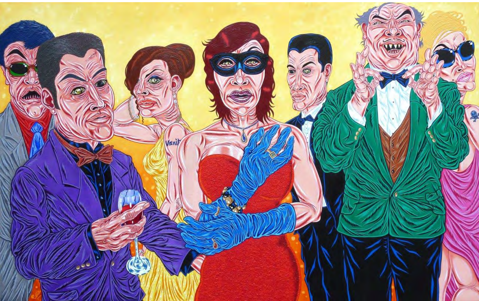
Shark Society Oil on canvas 100 x 160 cm 2012