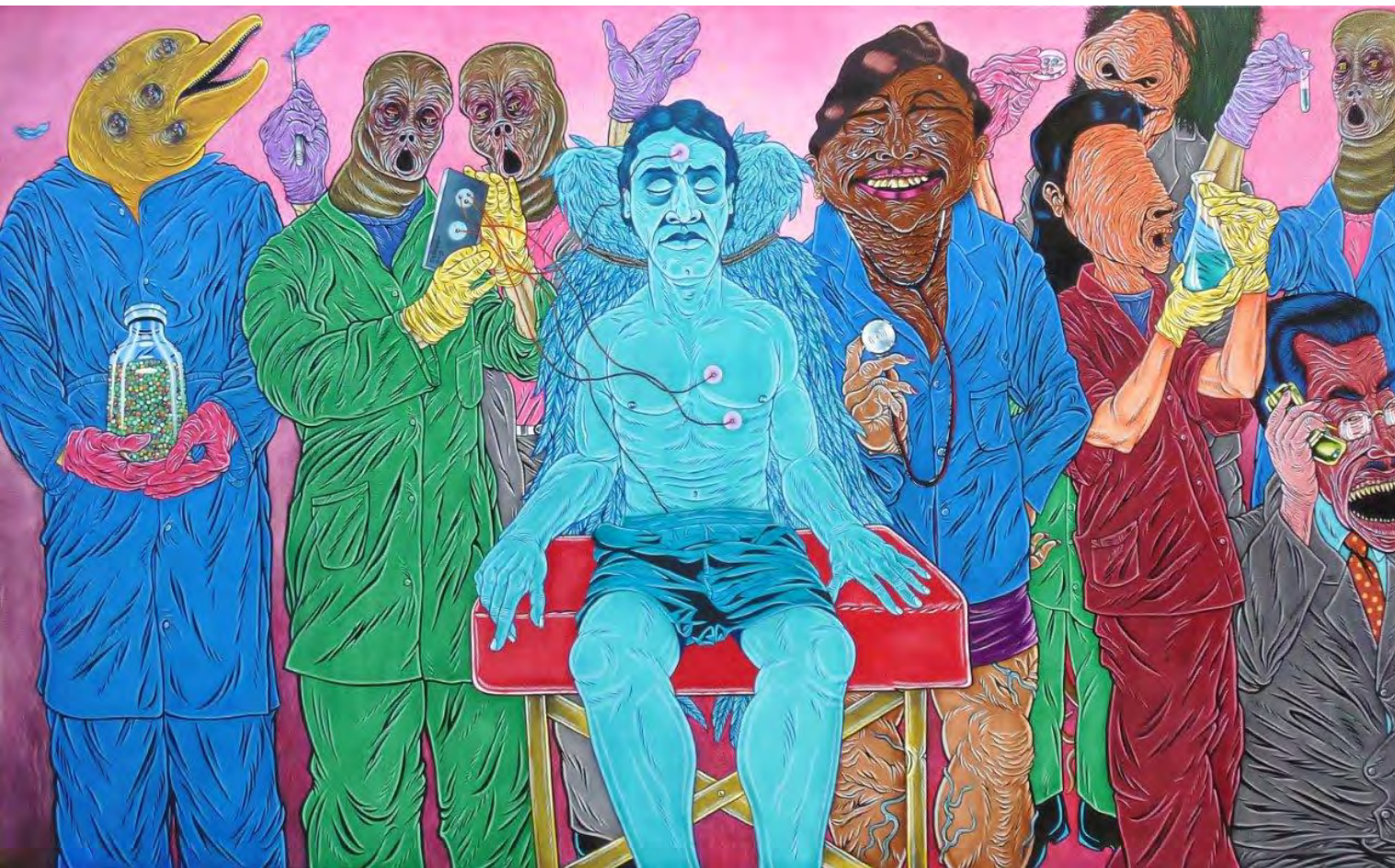
Potential Analysis Oil on canvas 100 x 160 cm 2009