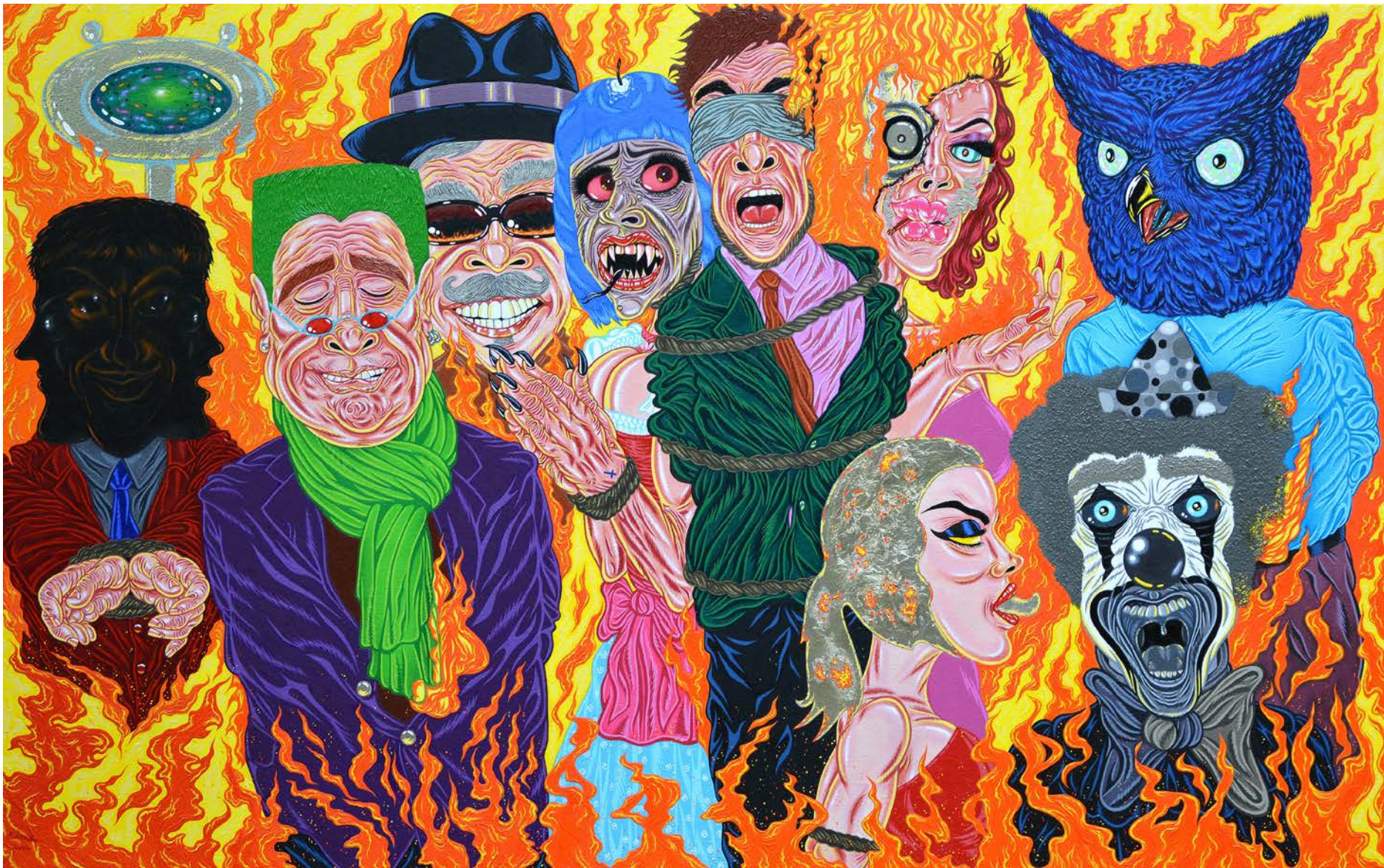
Purgatorial Fire Oil and silver leaf on canvas 100 x 160 cm, 2014