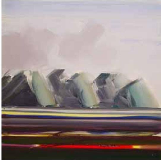
Snefeilsglacier 50 x 50 cm