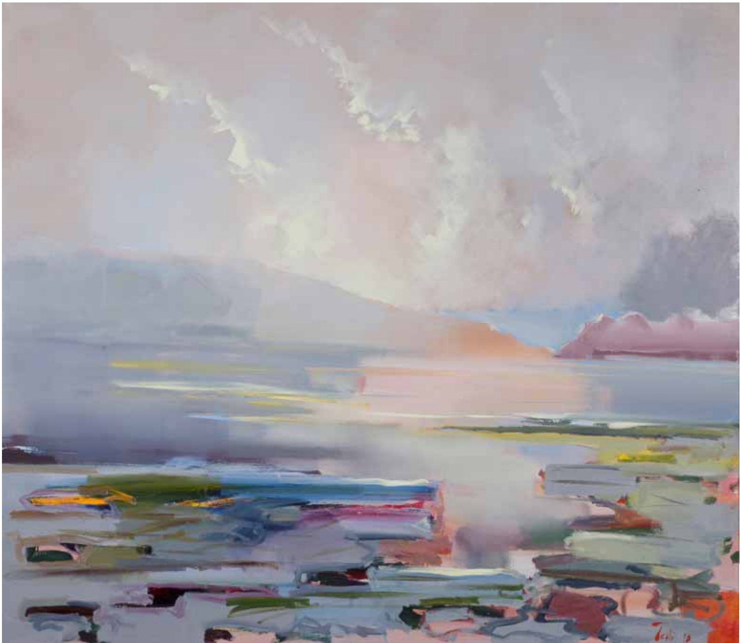
Tolli, 'After the ash I' . Oil on canvas 140 x 160 cm