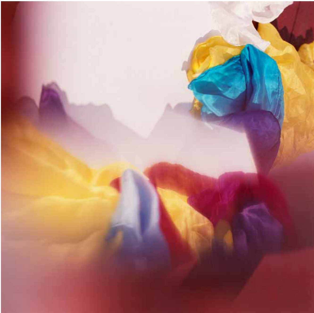
Bjargey Olafsdottir, 'Dream Mountains', Photography, 80 x 80cm