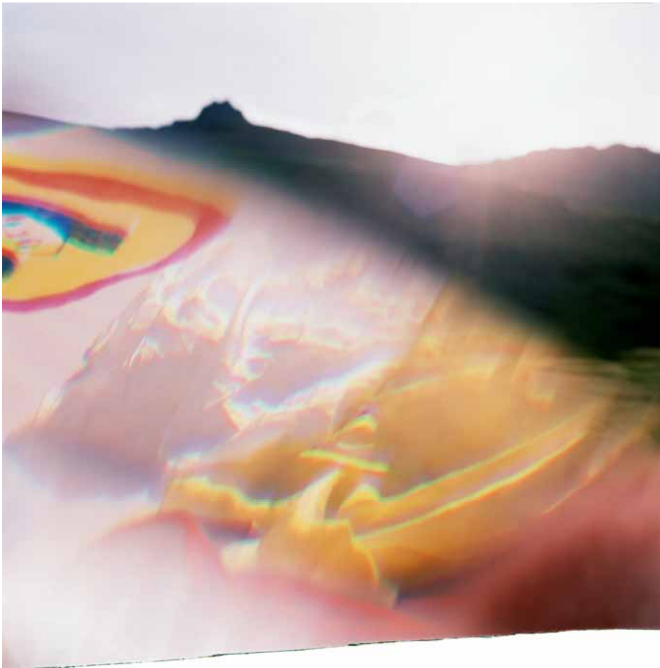
Bjargey Olafsdottir, 'Mesmerized', Photography, 80 x 80cm