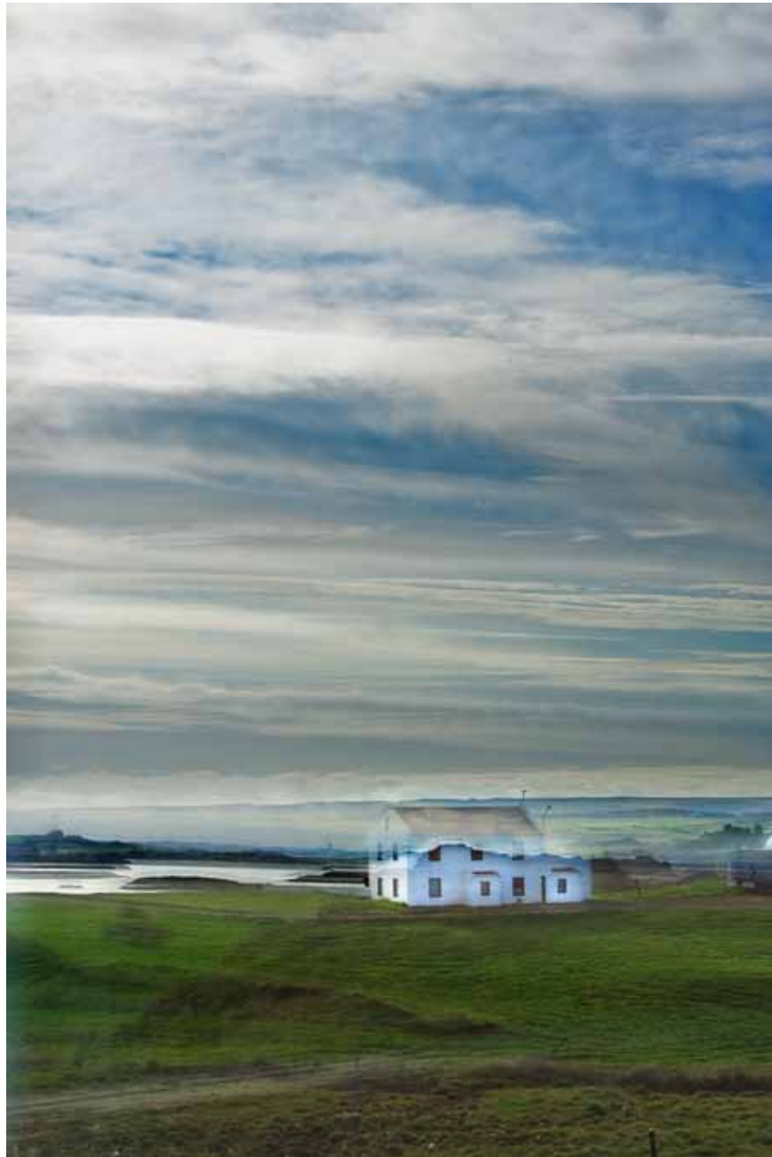
Iris Thorsteinsdottir, "Borgarnes II", edition of 5, 150 x 100 cm