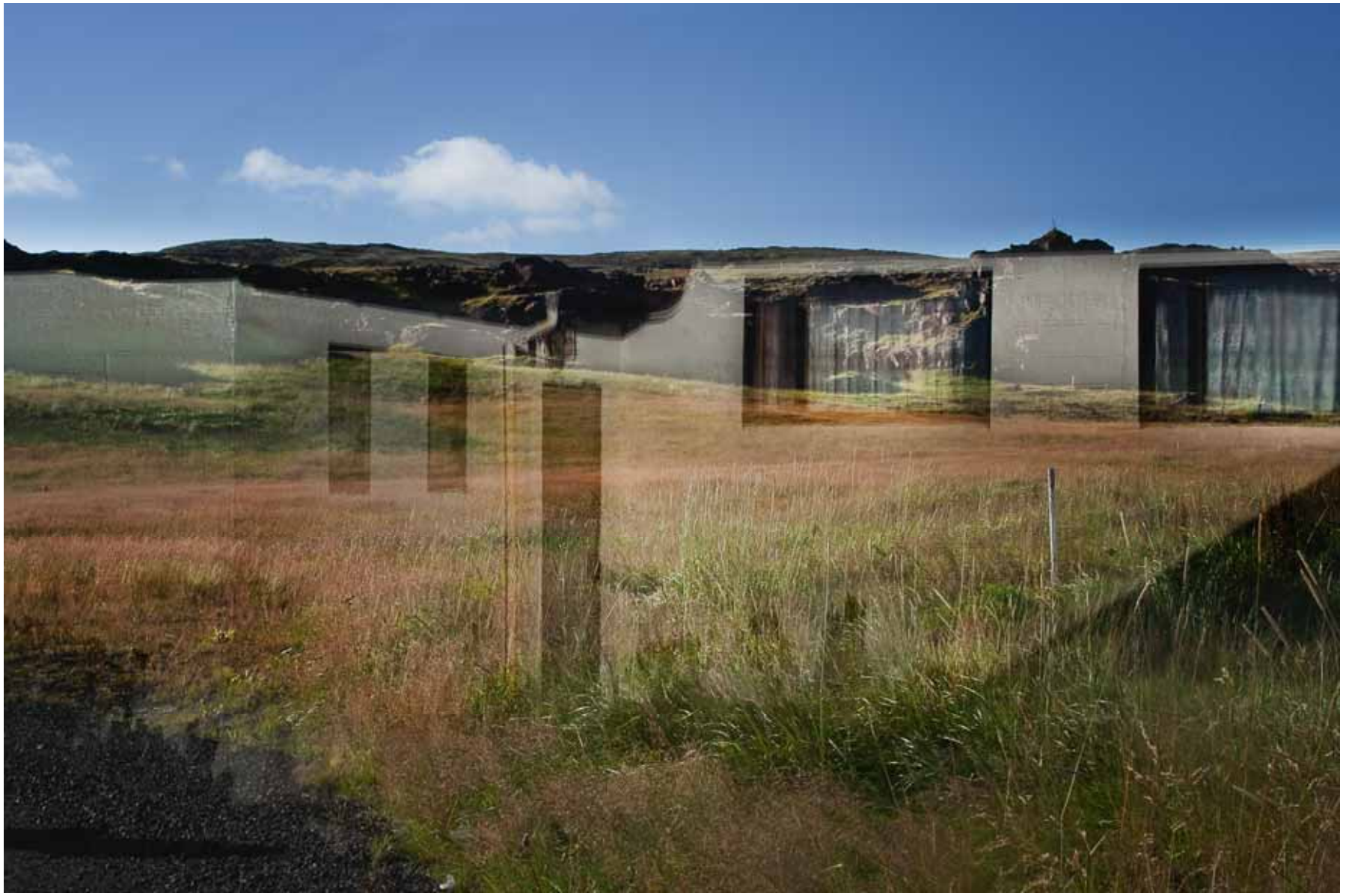
Iris Thorsteinsdottir, "Hveragerdi", edition of 5, 100 x 150 cm