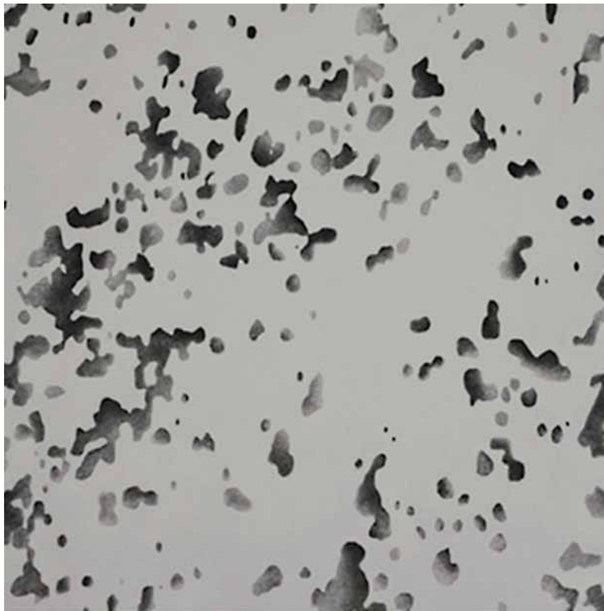
Gudrun Kristjansdottir, "Thaw Ili", Oil on linen, 115 x 115 cm