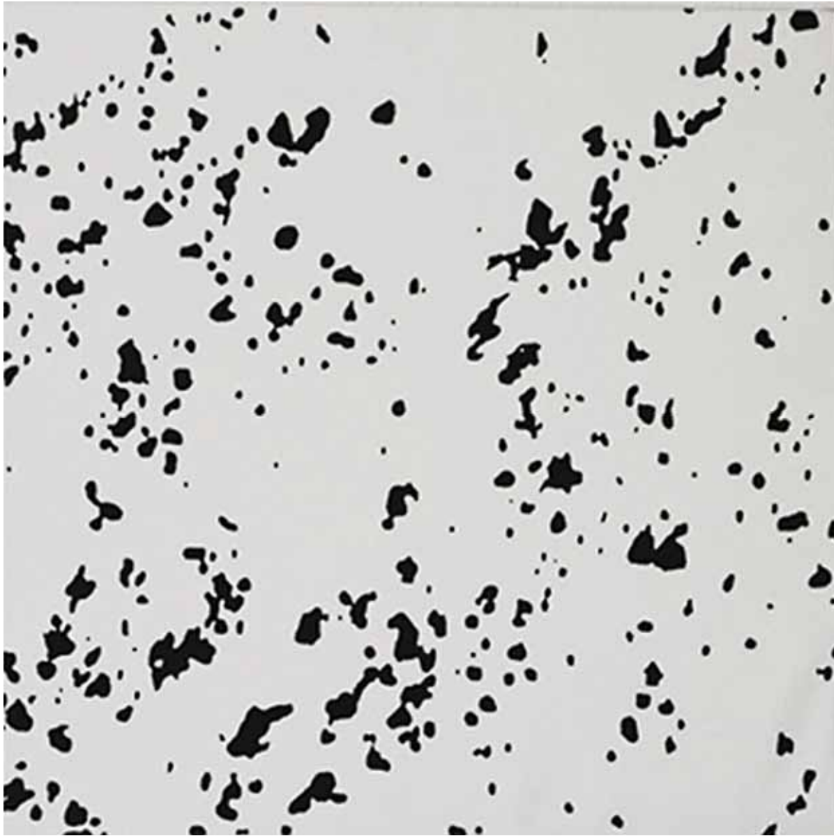
Gudrun Kristjansdottir, "Thaw IIIB", Oil on linen, 115 x 115 cm