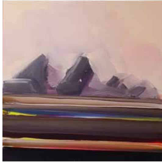
Peaks 50 x 50 cm