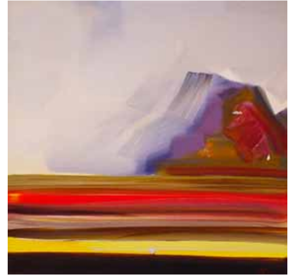
Dawn 50 x 50 cm