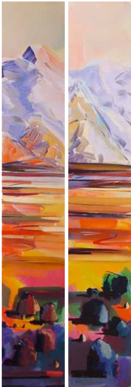
Tulli, 'Wasteland Glacier' . Oil on canvas 160 x 30 cm each (Diptych)