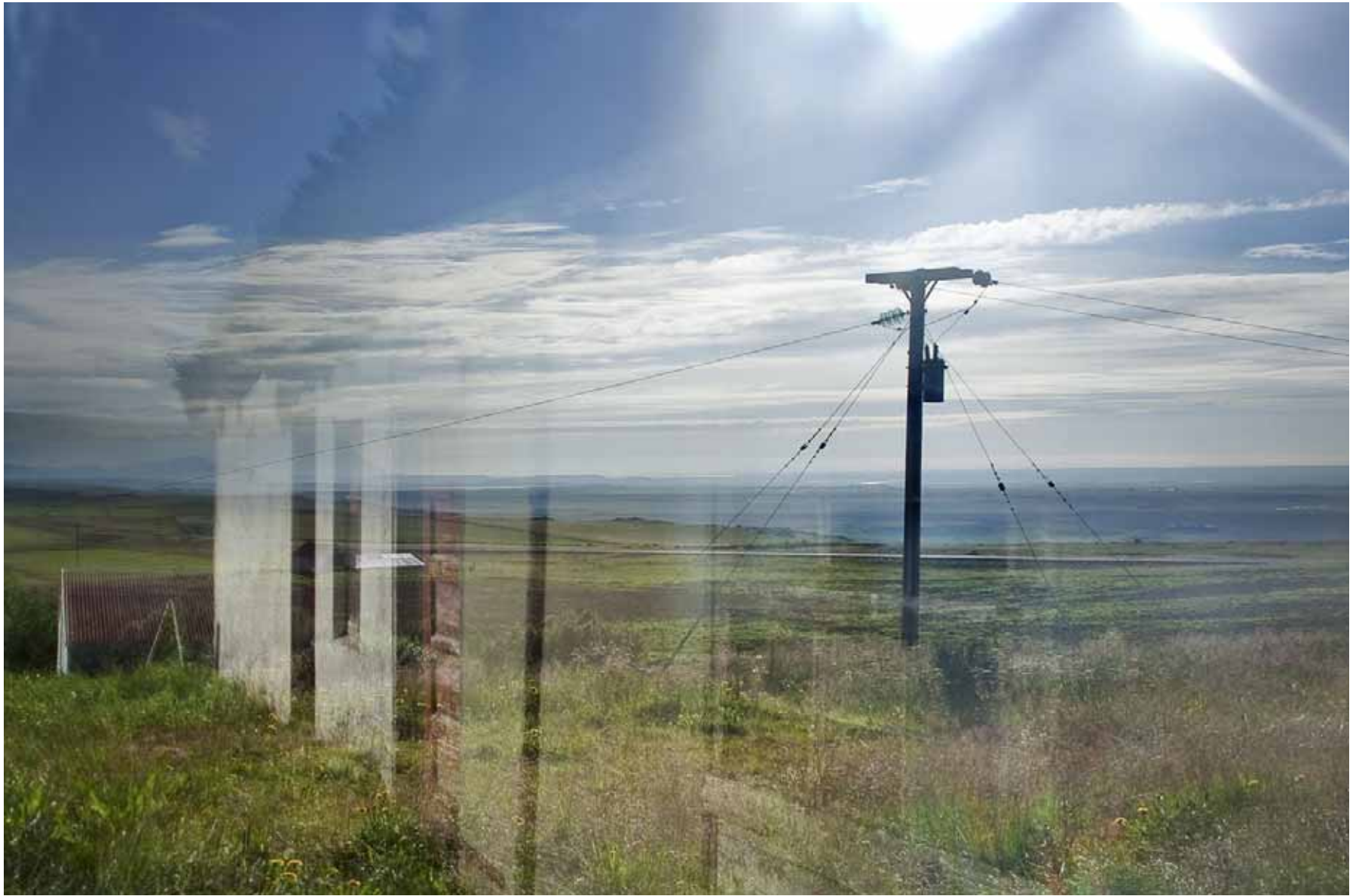
Iris Thorsteinsdottir, "Borgarnes", edition of 5, 100 x 150 cm